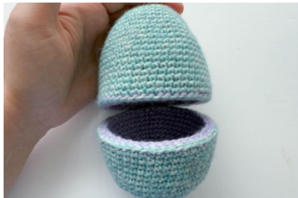
34. Two parts of the egg