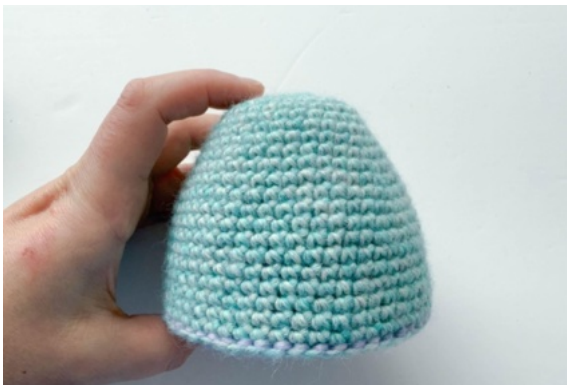
33. Top part of the egg