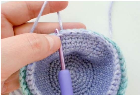
31. Make a slip stitch loosely