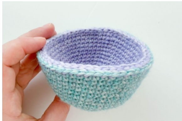
32. Bottom part of the egg