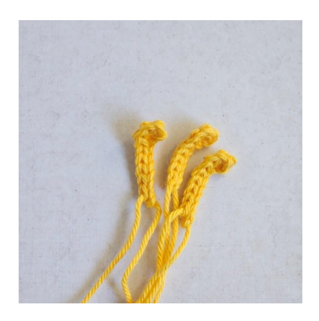
Ch8 Make 3sc into the second chain from the hook, then make 1slst into each of the 6 remaining chains. Fasten off, leaving a long tail.