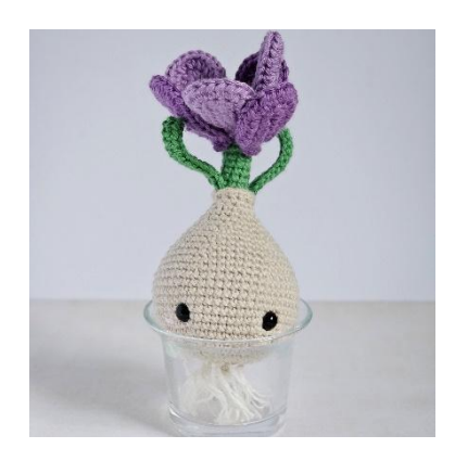
Enjoy! Lisbeth @onecraftymagpie