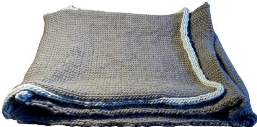
Image shows bag with gussets sewn in place ready for felting.

Image shows top of gusset attached to bag- and placement of I-cord trim (before felting). With Wrong Sides together, pin and back stitch the CO edge of the gusset section, between ridge rows 82 and 109. Align the BO edge of the gusset with the start of the I-cord edge on the front edge Row 1, and with the I-cord edge on the flap of the bag row 192.