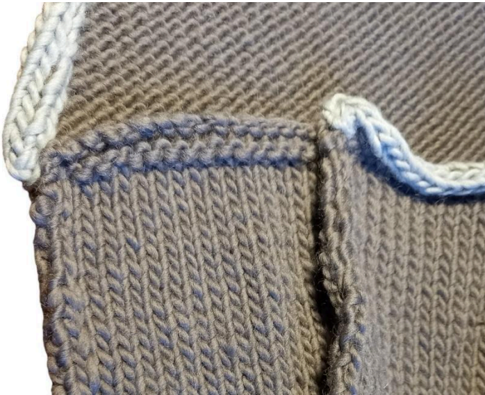
Image shows top of gusset attached to bag- and placement of I-cord trim (before felting). With Wrong Sides together, pin and back stitch the CO edge of the gusset section, between ridge rows 82 and 109. Align the BO edge of the gusset with the start of the I-cord edge on the front edge Row 1, and with the I-cord edge on the flap of the bag row 192.