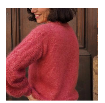
INFO AND TIPS