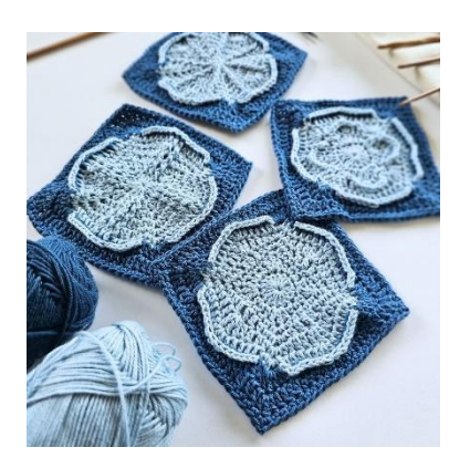
INFO AND TIPS

Watch me making the Compass Rose: East granny square here.