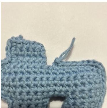
When you have a corner facing inward like this

Then go back to your crochet. Ch1 and work 1 sc in each st and side of the rows all around, passing through both pieces to assemble and stuff as you go. Finish with 1 sc in the last st and invisible join with the first one. Weave in ends.