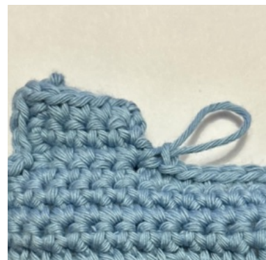
And work 1 sc in the first side of row available after the corner