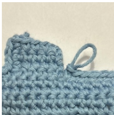
Work 1 sc in the last st available before the corner