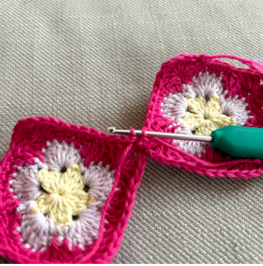
Now that you have two loops on your hook, single crochet.