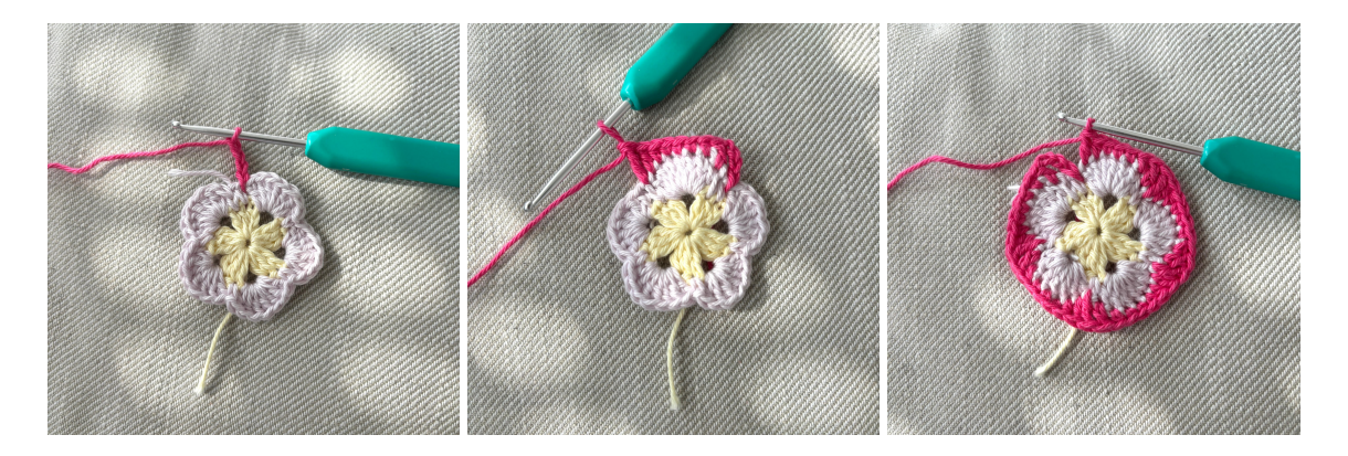
Round 3: Insert your hook into the last single crochet from the previous round and chain 4. (dc, hdc, sc 3, hdc, dc, tr) Repeat this sequence around. Slip stitch into the fourth chain and fasten off. (40 stitches)

Switch to Yarn C. In the next round, ch 4 counts as a tr.