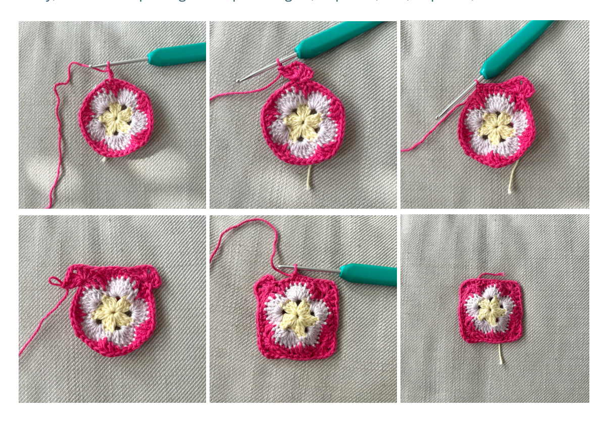
Weave in the yarn ends and block. Your granny square should measure 5 cm x 5 cm (2" x 2")

Lastly, Instead of repeating the sequence again, skip 3 sts, sc 4, skip 2 sts, sl st in the ch 3 and fo.