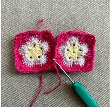
Now, insert your hook on the first stitch of the left granny square and pull up a loop.