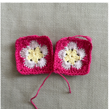
Insert your hook on the first stitch of the right granny square and pull up a loop.