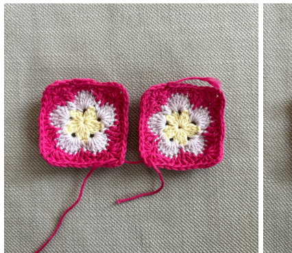
Use your 2.5 mm hook (US C-2) Tie a knot on two corners of the granny squares.