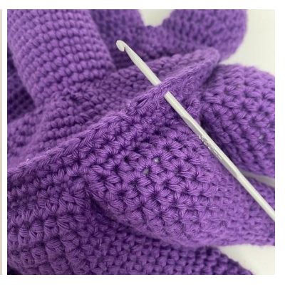
Enjoy! Sandy Jones / Crocheted It