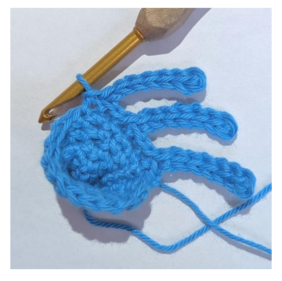
Crochet in FLO, [sl st 1 into the next st, chain 8, skip first ch, sl st 5, sc 2 along the chain, sl st 1 into the next st] 9 times (9 tentacles)