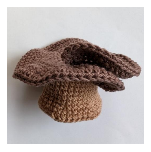
The two ends of the top disk will overlap as shown.