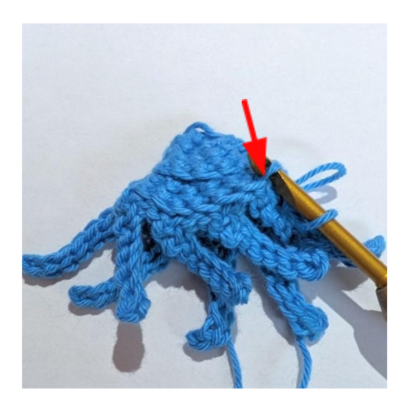
Crochet into the BLO of the stitches in R6, (sc 2, inc) 6 times (24)