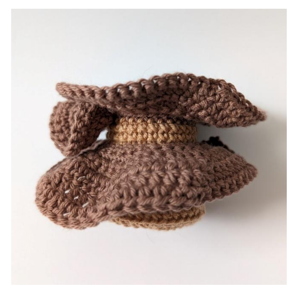
Sew the middle disk near the center (around R17) of the base.

Congratulations! You've completed your coral reef amigurumi! Share your project on social media! Tag @sirpurlgrey and include the hashtags: #hobbiidesign #hobbiiunderthesea