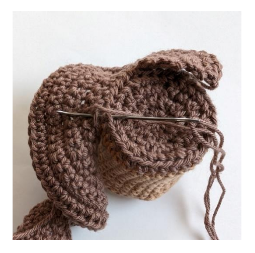
Sew the top disk along the top edge of the base. Use the front loops of R20 on the base as a guide.