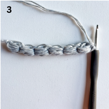
Row 1: (See photos 4 & 5) JS 5 turn (5 JS)