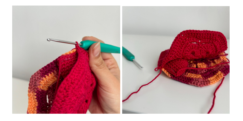
Repeat for the next two legs. See images:

Once you've properly aligned your crochet pieces, begin by inserting your hook into one corner of the red hexagon, capturing both the first stitch of one leg and a corner of the multicolored hexagon. Proceed to single crochet these three pieces together, then move on to the next stitch. Continue single crocheting along, and when you reach the midpoint of the first side, attach the second leg using the same technique.