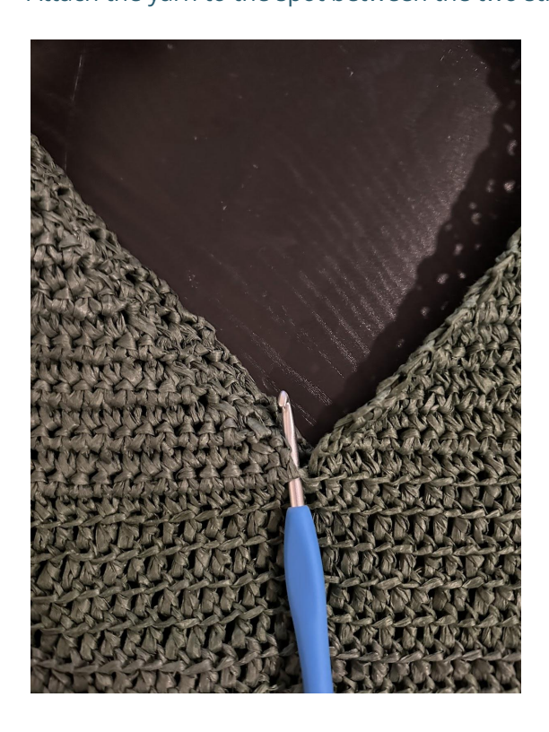
Chain 30 sts. Tie off and attach the other end to the same spot where your chain began.

Attach the yarn to the spot between the two straps.