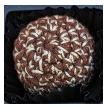
Truffle Fudge Ball (in col. B and col. H)

Hold the two colors together and work with both threads at the same time.