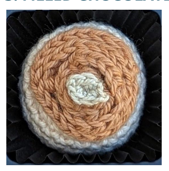
White Chocolate Nougat Swirl (col. D)