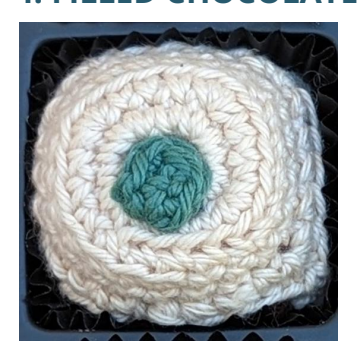
Pistachio Milk Chocolate (in col. D and col. C)