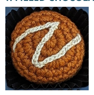
Caramel Chocolate (col. A)