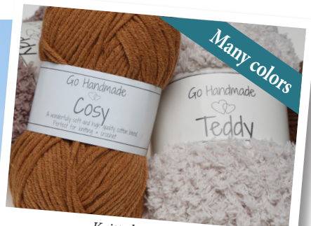
Knitted with Teddy - 100 % Polyester 50g/ 65 m Ribbed edges in Cosy - 60% Cotton/40% Acrylic 50g/ 100 m