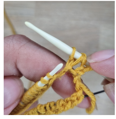
A double stitch was created, it's the yo above the st slipped. Repeat *k1, place the yarn in front of the work, sl1pw, yo* around.