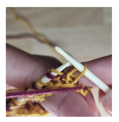
With yarn color B in front of the work. *Sl1pw