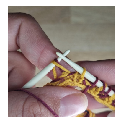
Before changing the needle be careful. The last stitch is a double stitch, check that you didn't lose the yo color A from the previous round.