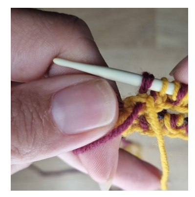
At the end of the round, you finish with: place yarn in front, sl1pw. Leave the yarn here and continue with the next round. Youplace the yo at the end of the next round.