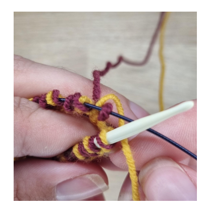
This round is work with color A. The yarn goes around the last st from the previous round above the yarn color B.