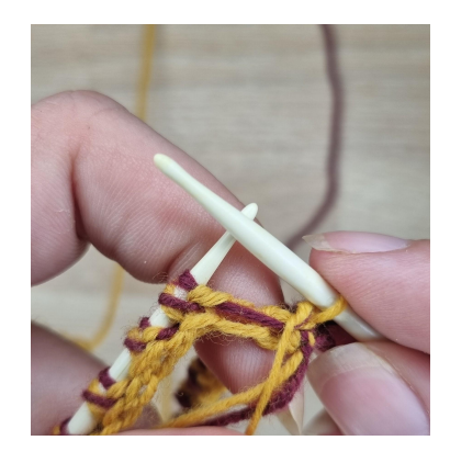
Place the yarn in front of work.