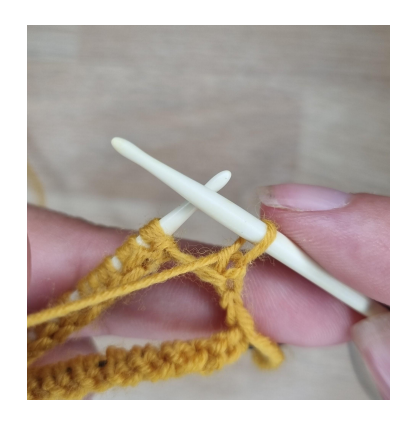
With color A, k1 and place yarn in front of the work