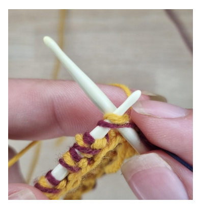
*Knit the yo and the next st together like one st. (= brk)