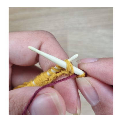
Purl the yo and the next st together like one st (= brp)