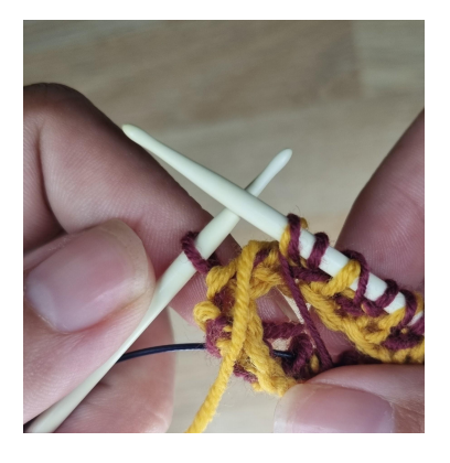
At the end of the round you will have this. The yarn A in front of the work and a stitch color B.