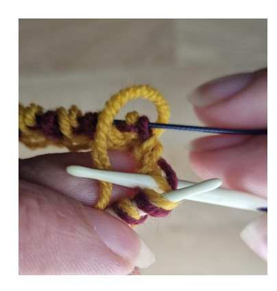
During the round, after changing the needle, check that the yarn goes above the last needle used (or cable for magic loop).