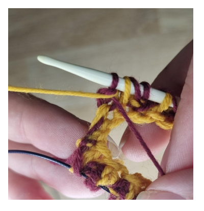
Work your brp. Place the yarns like this. Leave color B on the right in front of work and color A on the left, in the back of the work to be ready for the next round.

Untwist the threads when necessary, to work comfortably.