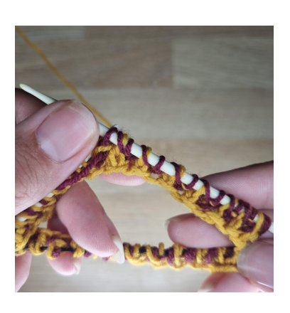
Repeat from * to * around.