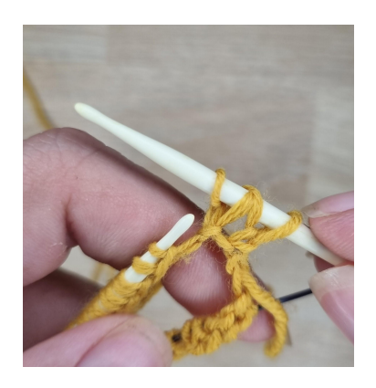
Knit the next stitch.