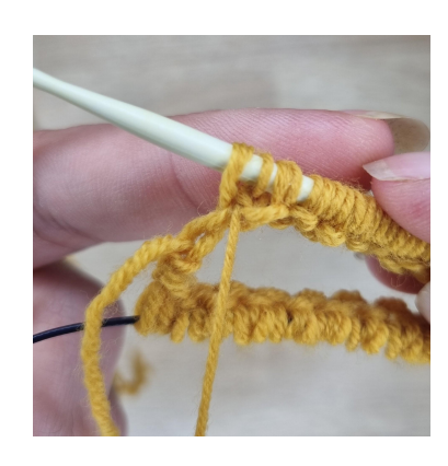
At the end of the round, you will finish with: place the yarn in front of the work, sl1pw. Leave the yarn and continue with the next round.