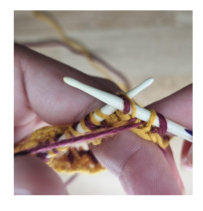
Purl the yo and the next st