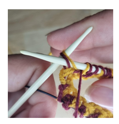
The last st of the round is a brp so place the yarn color A above the needle to have the double st for the brp and block the yarn with your right hand.