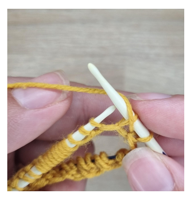
Place yarn above the right needle like this. (= yo)