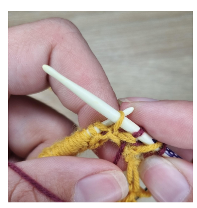
*SI1pw with yarn in front.