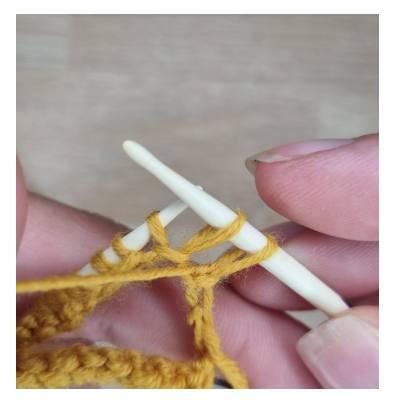
Slip 1 purlwise (= sl1pw)