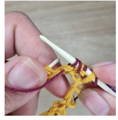
Like this. Repeat from * to * around.