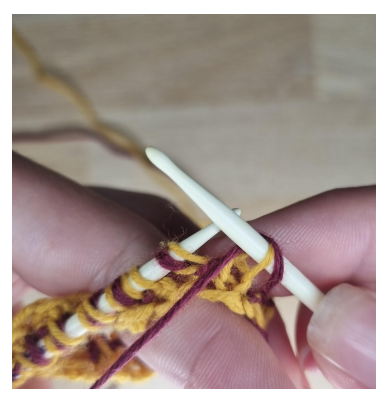
Yo around needle,