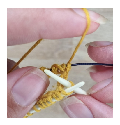
When knitting the first st after changing the needle. The yarn goes above the last needle used (or cable for magic loop). Be careful to not twist the sts.