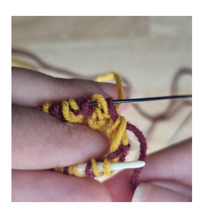
This round is work with color B. The yarn goes under the needle. Do not cross the yarn A and B.