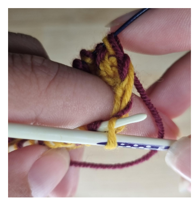
After changing the needle, the yarn goes below the last needle used (or cable for magic loop).