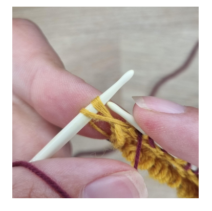
Before changing the needle, be careful, the last stitch is a double stitch, check that you