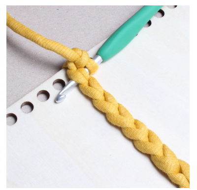
6) Place the hook under the first stitch.