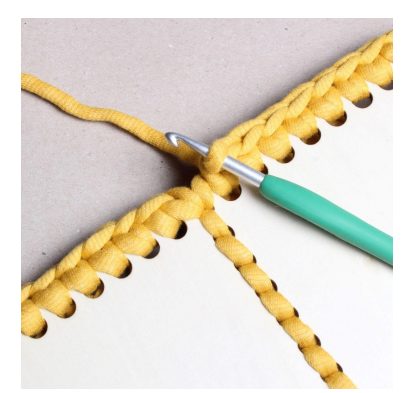
15) Finish the round.