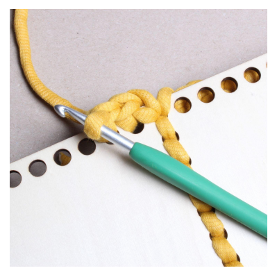
13) Work 1 sc in every hole.