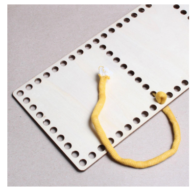
1) Pull the yarn through the outermost hole of the divider. through the next hole. The working yarn is behind the work.

First, the divider is worked (photos 1-10), then you work in a spiral until the desired height is achieved.