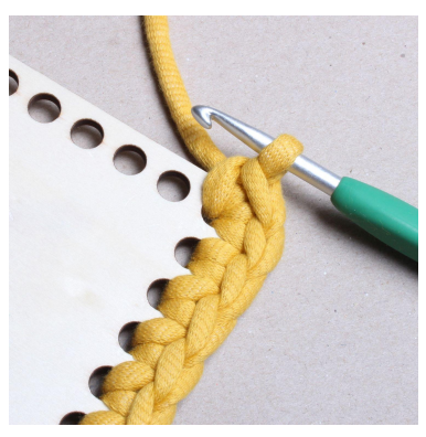
14) Work 2 sc in all corners.