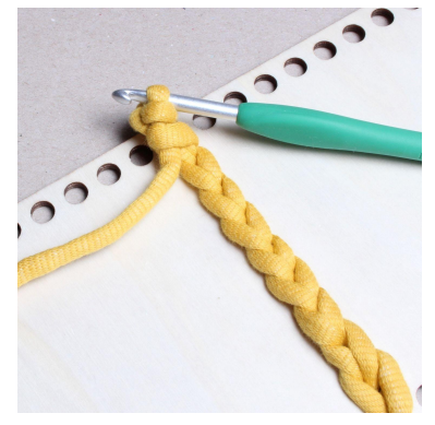
7) Work 1 single crochet.