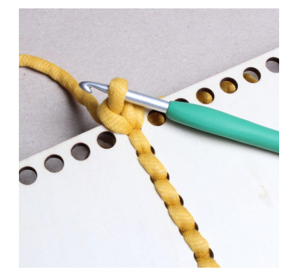
12) Work 1 sc.