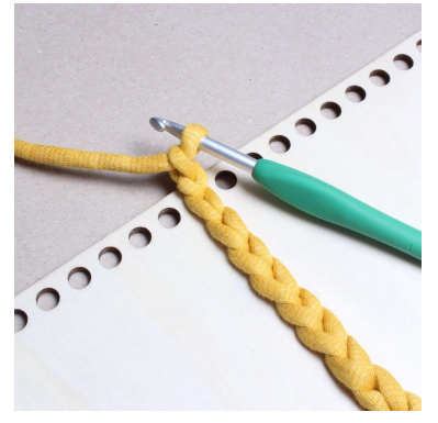
5) Yarn over, pull it through and ch 1.