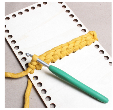
8) Work 1 sc in every stitch.