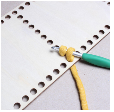
2) Pull the working yarn