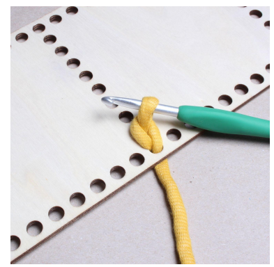
3) and pull it through the loop on the hook = 1 slip stitch.