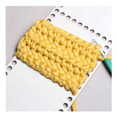
10) Work until the desired height.