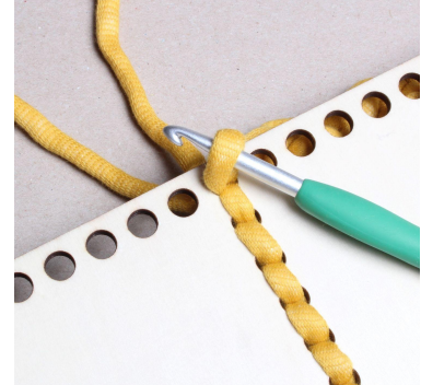
11) Turn the bottom upside down to work the edge. Pull the yarn through.