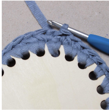
11. work 1 sl st