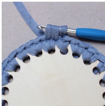
8. pull up a loop in the next st