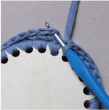
10. Pull up a loop in this st