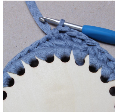
12. Continue in pattern as shown in pictures 6-9 until end of round.