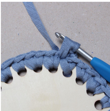
7. pull up a loop in the same sc