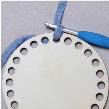
1. Pull up a loop