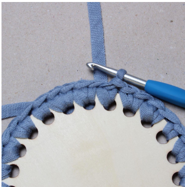
4. Join round with a sl s