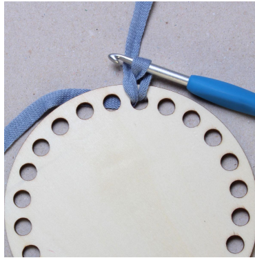
2. ch 1