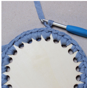
5. Ch 1