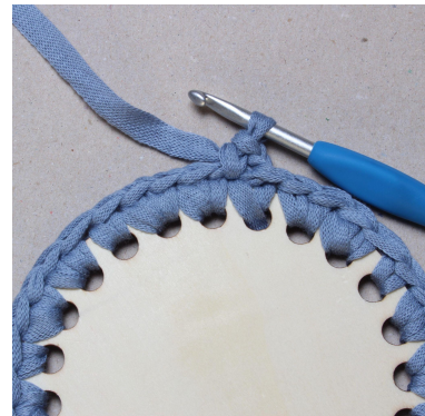
6. work 1 sc