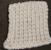
Cosy: Off White SBF: Off White