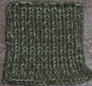
Cosy: Hunting Green SBF: Soft Green