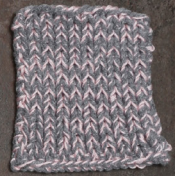
Cosy: Grey SBF: Light Pink