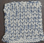
Cosy: Off White SBF: Jeans Blue