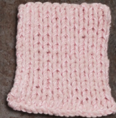
Cosy: Pastel Rose SBF: Light Pink