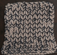
Cosy: Pastel Brown SBF: Dark Grey