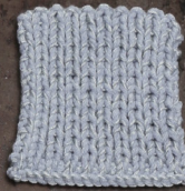
Cosy: Sky blue SBF: Light Grey