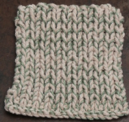
Cosy: Pastel Brown SBF: Soft Green