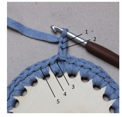
6. Pull up a loop in these stitches: