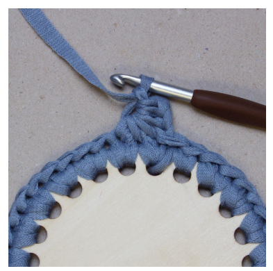
13. Ch 1