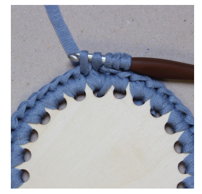
10.- pull up a loop (4) = 5 loops