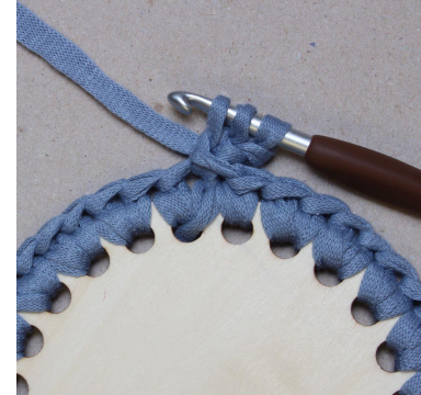
8. - pull up a loop (2) = 3 loops