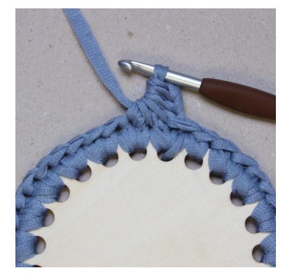
12. Yarn over and pull through