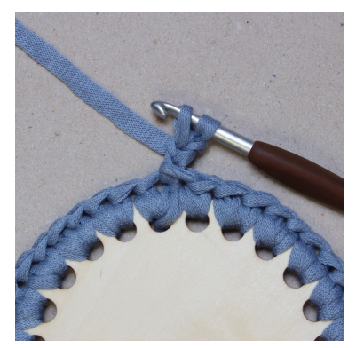
7. - pull up a loop (1) = 2 loops