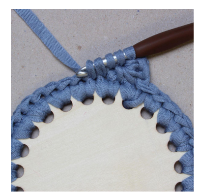
18. - pull up a loop (4) = 5 loops