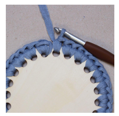
3. Work 2 sc in each hole