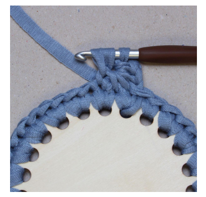
16. - pull up a loop (2) = 3 loops