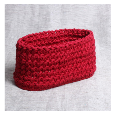
Continue until you have the desired number of rounds.