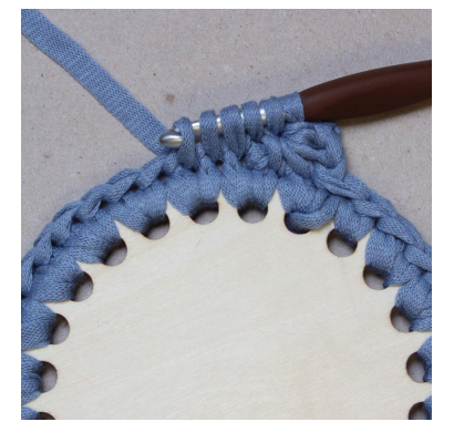
19. - pull up a loop (5) = 6 loops