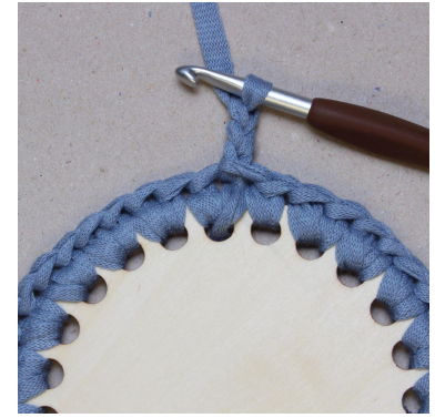
5. Ch 3