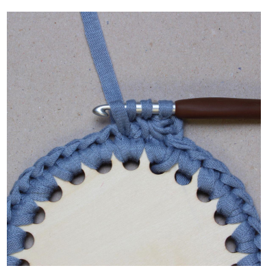
17. - pull up a loop (3) = 4 loops