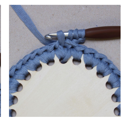
9. - pull up a loop (3) = 4 loops