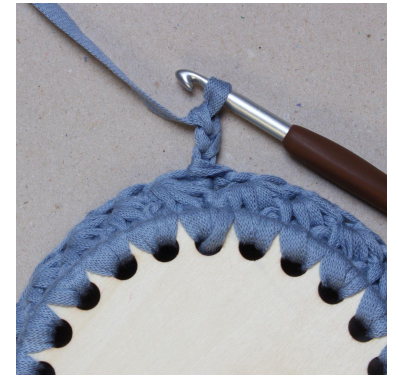
23. Ch 3 and work pattern as image 7-22