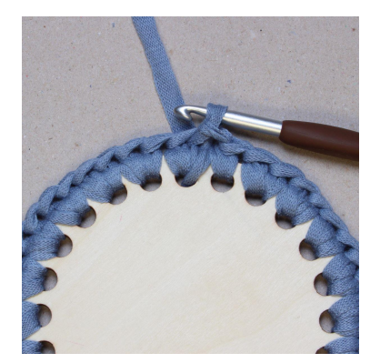
4. Sl st to join