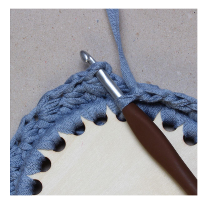
21. Join round by working into this stitch