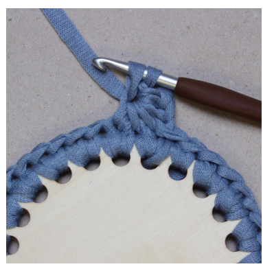
15. - pull up a loop (1) = 2 loops