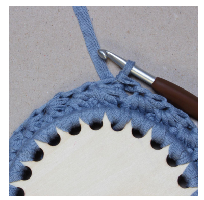
22. work 1 sl st