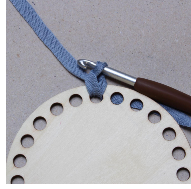
2. Ch 1