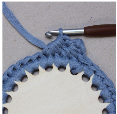
20. Yarn over and pull through. Repeat from image 13 until end of round