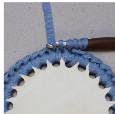
11.- pull up a loop (5) = 6 loops