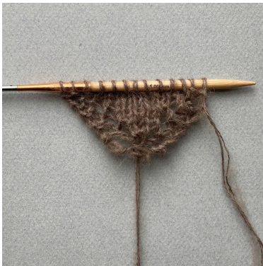
Beginning of bandana

Repeat *-* 3 more times = 13 sts on the needle