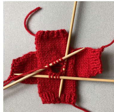
Picking up sts for collar