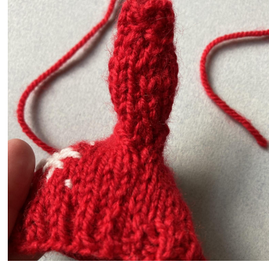
Finished side seam