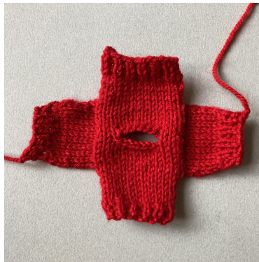
Sleeves are finished