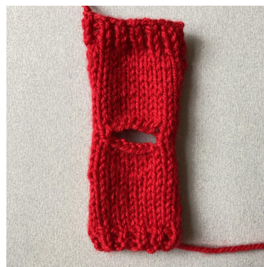
Back and front panels finished