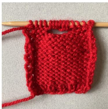
Cast-on for neck, back panel