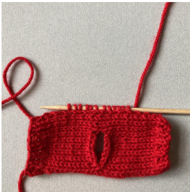
Picking up sts for sleeve