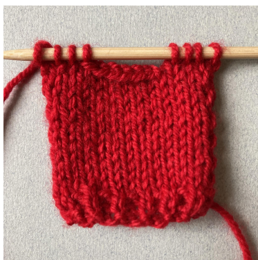
Front panel, bind-off for neck