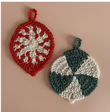
The Peppermint and Green Swirl ornament

Round 4: [Ch 2 (counts as first hdc throughout), hdc]. 2 dc, [tr, ch 3, sc into the first ch, tr]. 2 dc, [2 hdc], 2 hdc, {[2 sc], 2 sc}, repeat { } 3 more times, [sc, ch 10, ss into the sc, sc], 2 sc, repeat { } 3 more times, [2 sc], 2 hdc. Ss into the top of the ch 2, and fasten off (48 sts and 2 ch-sps).