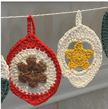
The Popcorn and the Star ornament

Round 4: Ch 3, 2 dc, [2 tr], [2 tr], 3 dc, [2 hdc], hdc, 6 sc, 3 hdc, [2 hdc], 3 dc, [2 tr], [tr, ch 10, ss into the tr, tr], 3 dc, [2 hdc], 3 hdc, 6 sc, hdc, [2 hdc], ss into the top of the ch 3, and fasten off (48 sts + ch10-sp).