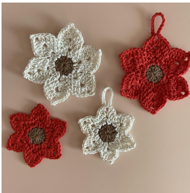
The small and the large Poinsettia

Round 3: Ch 1 (counts as first sc), dc. In the ch3-sp [2 dc, ch 15, sc into the first ch of the ch 15, 2 dc], dc, sc. {Sc, dc, in the ch3-sp [2 dc, ch 3, sc into the first ch of the ch 3, 2 dc], dc, sc}. Repeat { } 4 more times. Ss into the ch 1, and fasten off. (48 sts + 6 ch-sps).