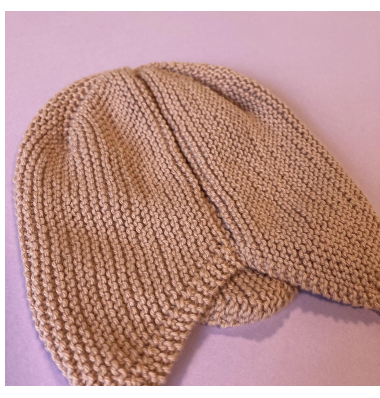
CO edge and the BO edge sewn together