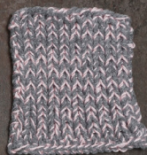
Cosy: Grey SBF: Light Pink