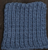
Cosy: Jeans Blue SBF: Jeans Blue