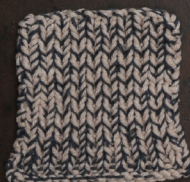
Cosy: Pastel Brown SBF: Dark Grey