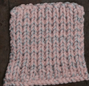
Cosy: Pastel Rose SBF: Light Grey