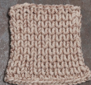
Cosy: Pastel Brown SBF: Nude Beige