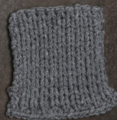
Cosy: Grey SBF: Grey