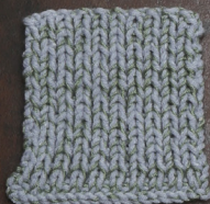
Cosy: Sky Blue SBF: Soft Green