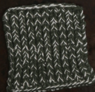
Cosy: Hunting Green SBF: Off White