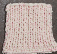
Cosy: Off White SBF: Light Pink