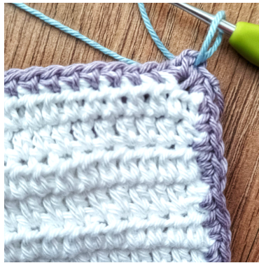
Join a new color in the ch2 space