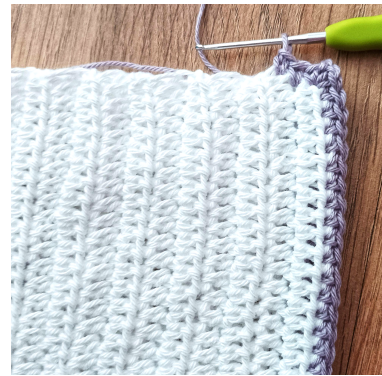
Sc around the back of the bonnet