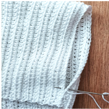
Sew the bonnet from the inside