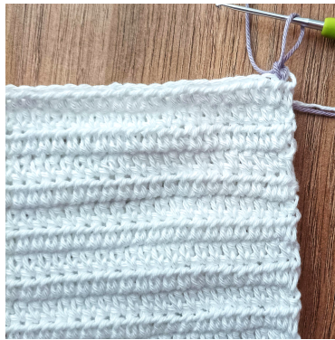
Ch1, [sc, ch2, sc] in the same sts