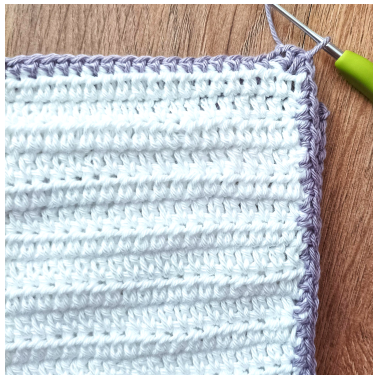
Slst to the first sts