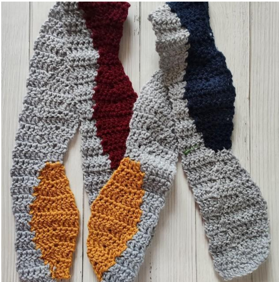
Photo: L and first Diamond Strip joined together

Repeat Rows 1-14 nine more times, ending with Row 140 of 10th diamond, F.O. and weave ends in.