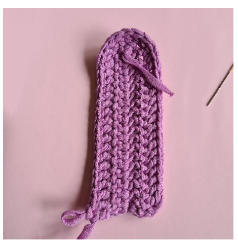
9. 16 dc. 1 dc in the t-ch. Turn