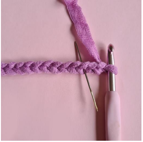
1. Ch 20, 1 dc in the third ch from the hook,