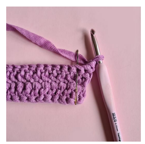
ch 2, skip the first st