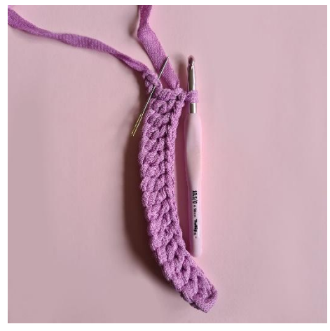
2. 16 dc, 3 dc into the same st.