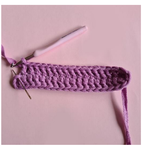
4. 2 dc in the last st.