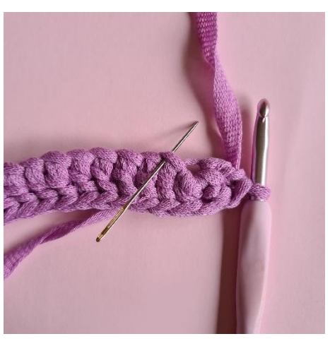
3. turn around the corner and working in the loops on the other side of the chain.16 dc