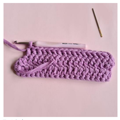
7. 16 dc