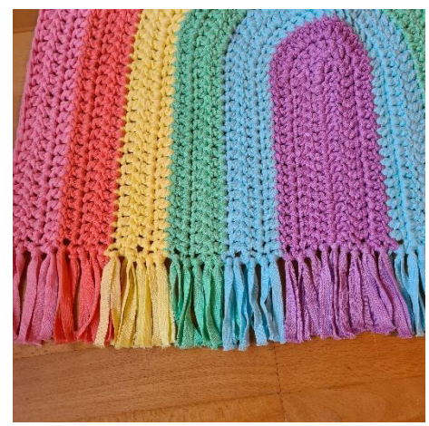
Enjoy! Super Cute Design / Jennifer Santos