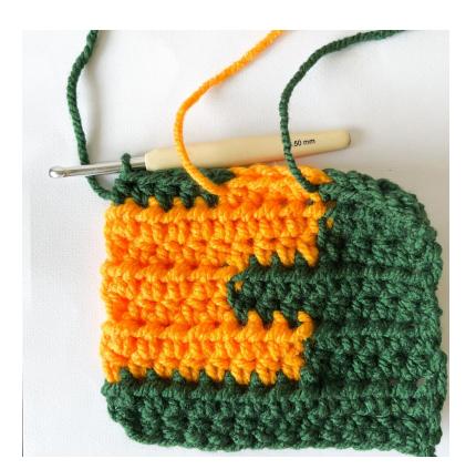
If you need to use the same color twice in a row, for example, if I was to change back to green at the point indicated by the red arrow, I would need to add a new green bobbin. This means that