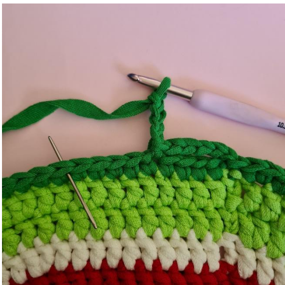
ch 4, skip 4 st,