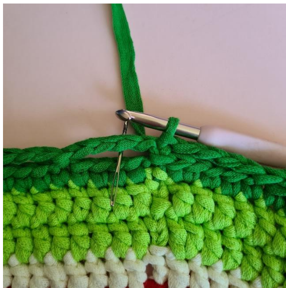
[3 sc, ch 1, 3 sc]