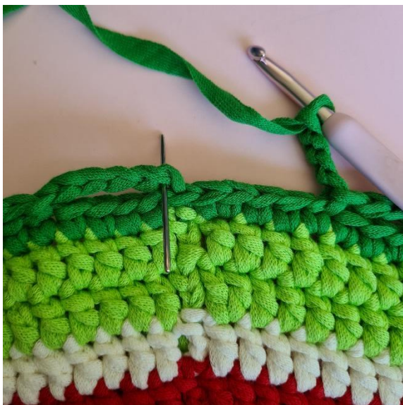
Finish with 1 sl st in the first ch