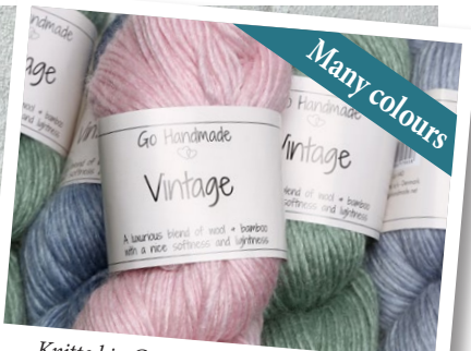
Knitted in Go handmade's Vintage Hank - a luxurious mix of wool and bamboo: 70% Wool/30% Bamboo, 100 g/240 m.

Buttons Knitting needle: 3,5 mm Gauge: 26 sts/10 cm