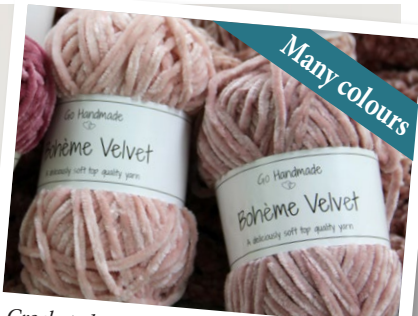
Crocheted in Go handmade's Bohème Velvet "double" - a delicate and super soft top quality velour yarn: 100% Polyester, 50 g/70 m.