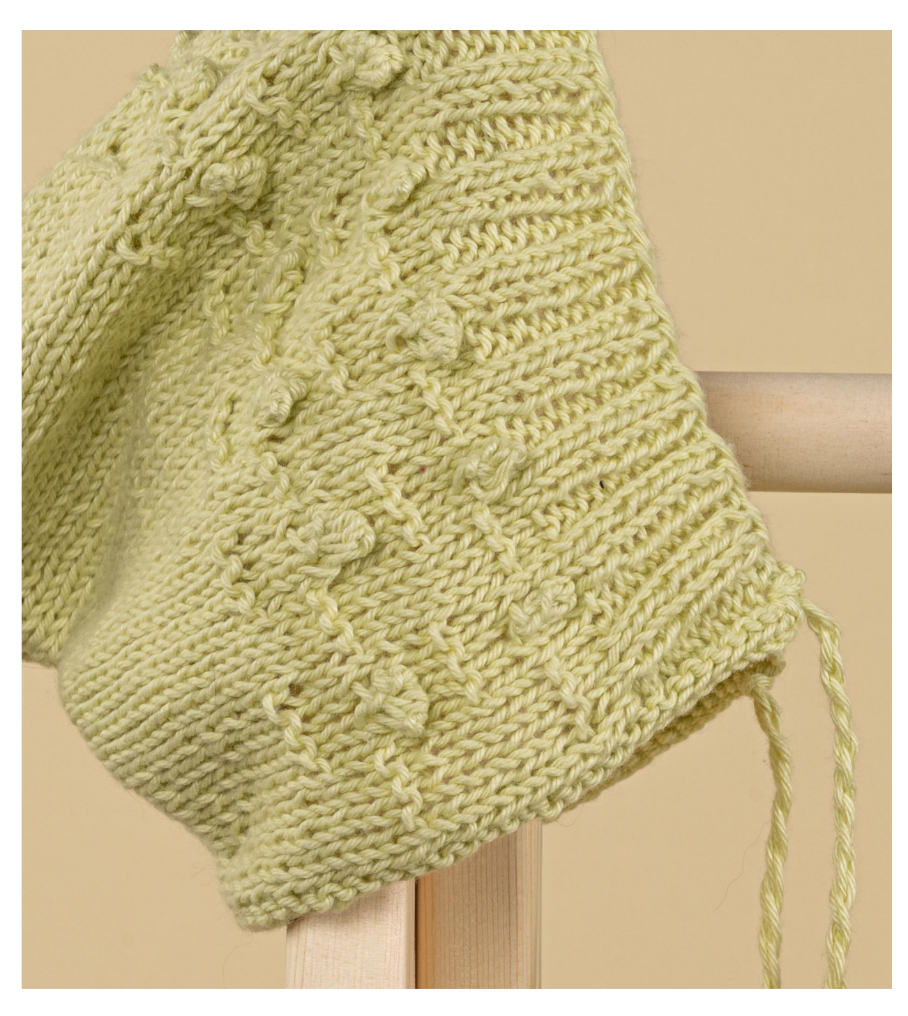
Happy knitting! Sanna Mård Castman - Soolorado