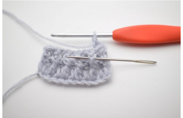
4. Work 1 fpdc around the next st. The needle indicates how to work the fpdc around the dc post of the previous row.