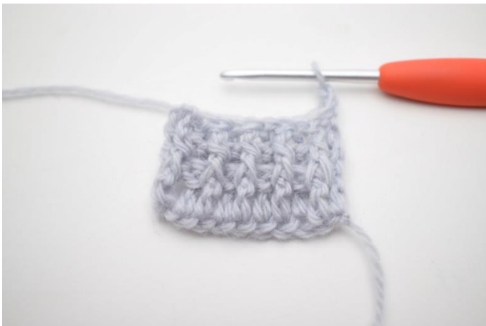
1. This row is a repetition of row 2. Ch 3 and turn.