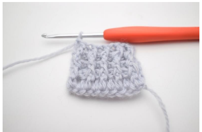
4. Work 1 fpdc around the next st. Work 1 regular dc in the last st.