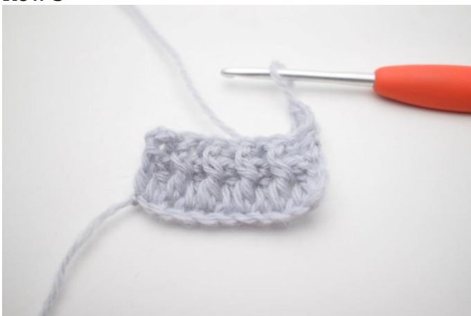
1. Ch 3 and turn.