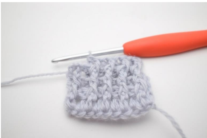
3. Repeat "to" until the last 2 sts.