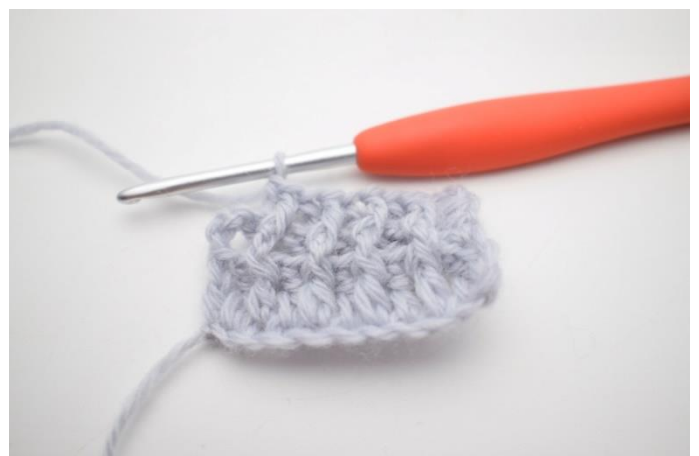
8. Work 1 bpdc around the next st.