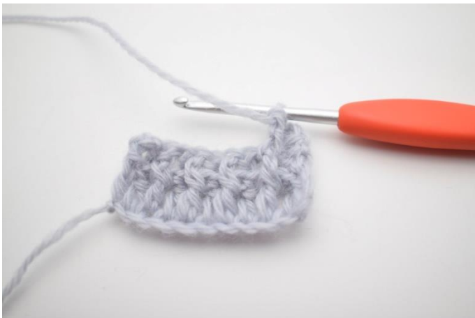
5. Like this.