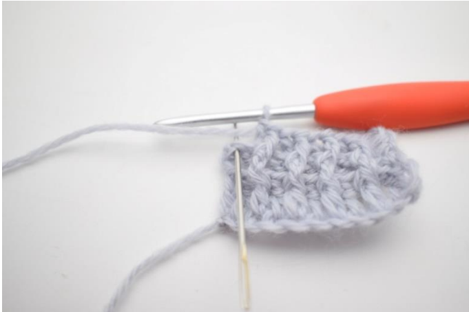
9. Work 1 regular dc in the last st.