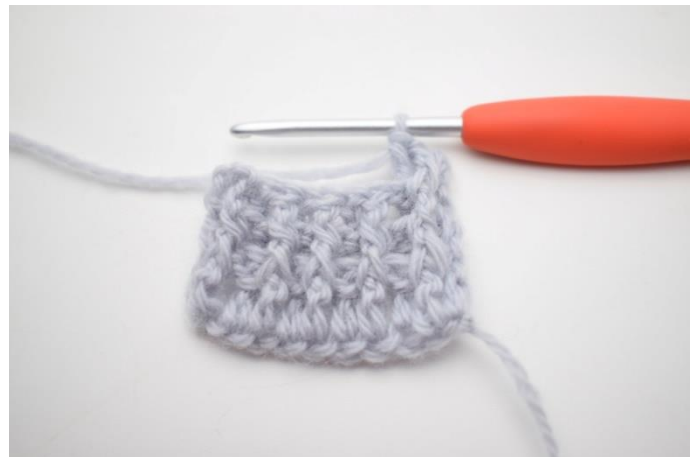
2. "Work 1 fpdc around the first st, work 1 bpdc around next st".