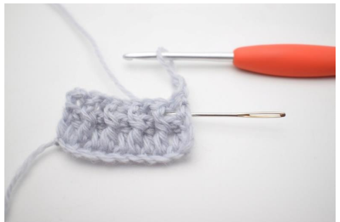
2. Work 1 bpdc around the first st. The needle indicates how to work the bpdc from the back around the dc post of the previous row.