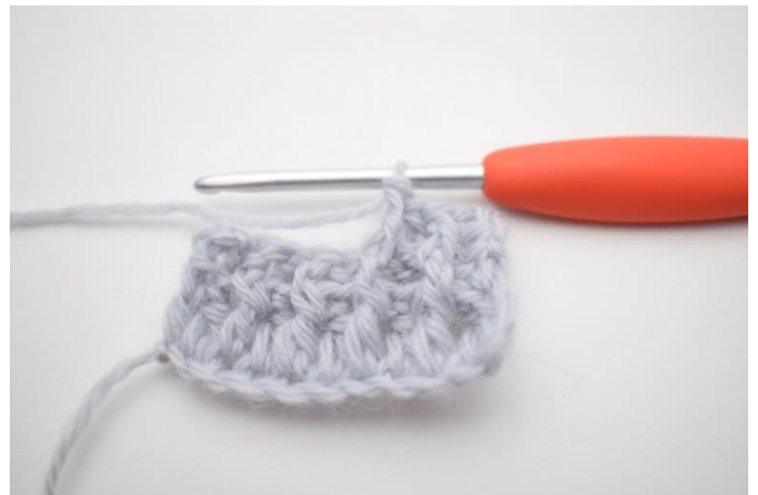
6. "Work 1 bpdc around the first st, work 1 fpdc around next st".