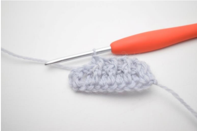
7. Repeat "to" until the last 2 sts.