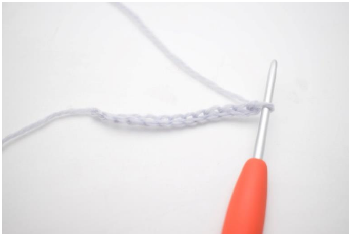
1. Chain 25.