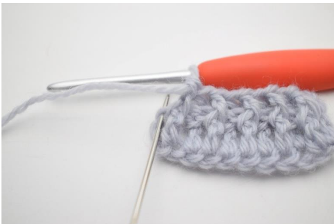
9. Work 1 regular dc in the last st.