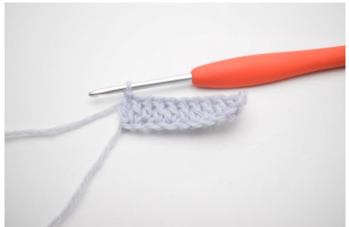
4. Work dc to the end of the row. (23)