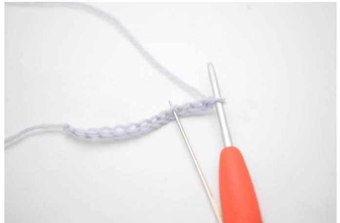
2. Work 1 dc in the 4th ch from the hook.