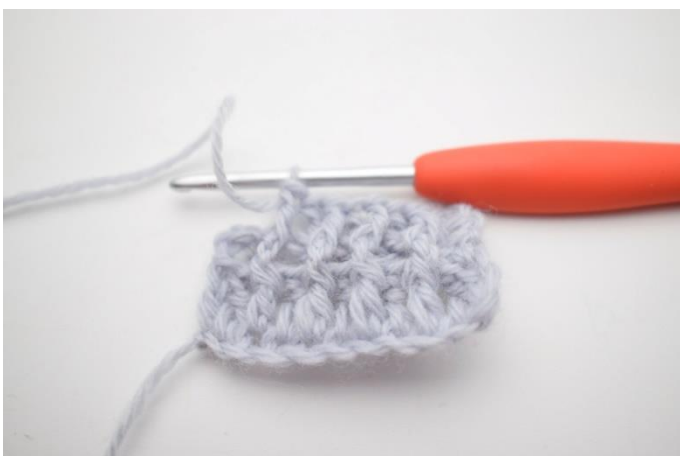
7. Repeat "to" until the last 2 sts.