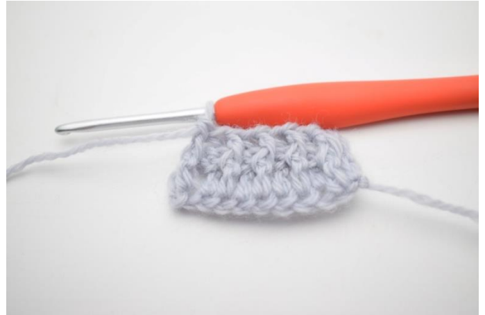
8. Work 1 fpdc around the next st.