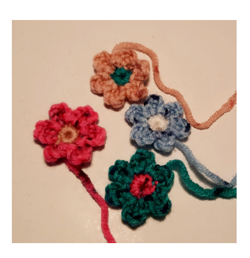
Leaf Make 4 with Tweed Dreams in color Dark Mint

Ch 8, begin in the 2nd chain from the hook.