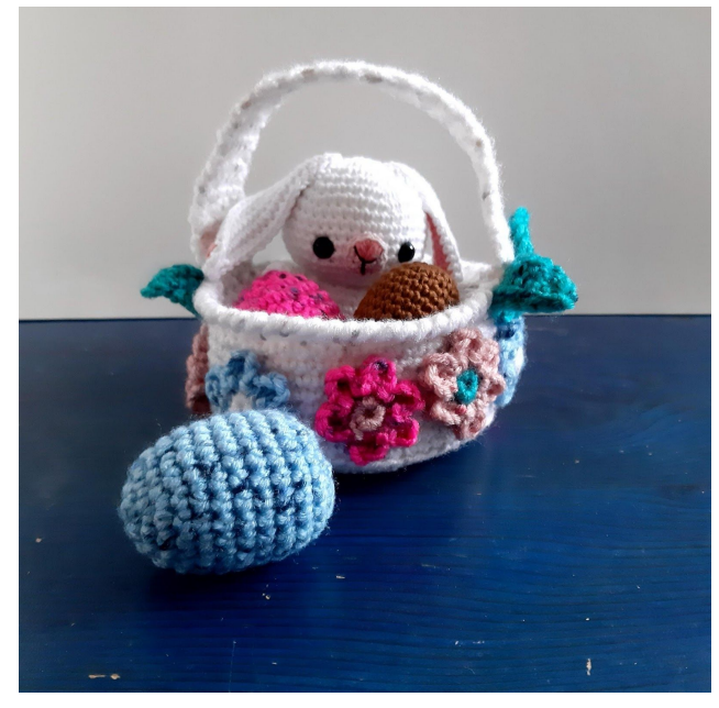
Enjoy! Kind regards