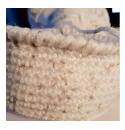
Handle In Sea Salt

Ch 6, begin in the 2nd chain from the hook. Rnds 1-40: 5 sc, ch 1 and turn Sew the handle firmly onto the inside of the basket.