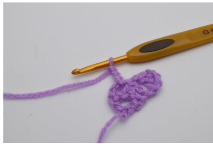
6. Ch 3.