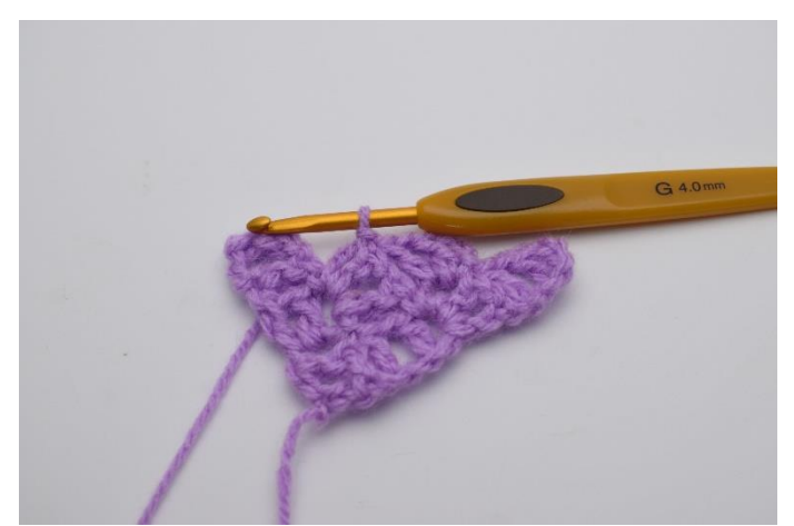
5. Work 1 sl st into the square below.