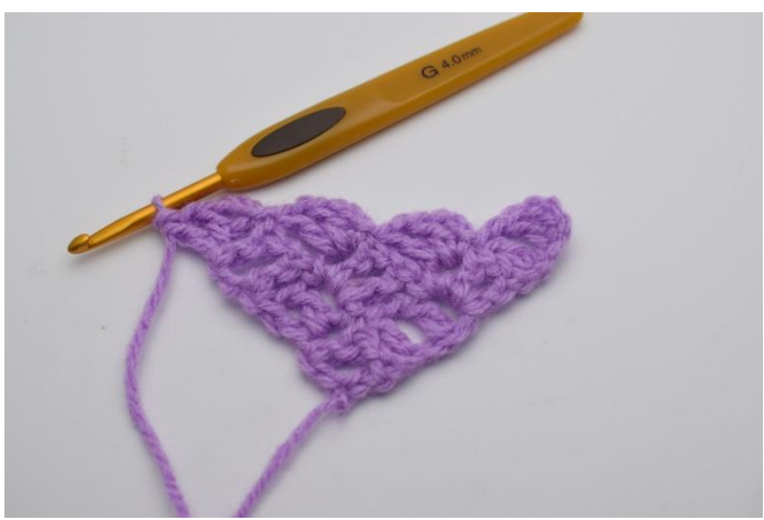
8. Ch 3 and work 1 dc, ch 1 and 1 dc down into the chain arch where you just made a sl st.