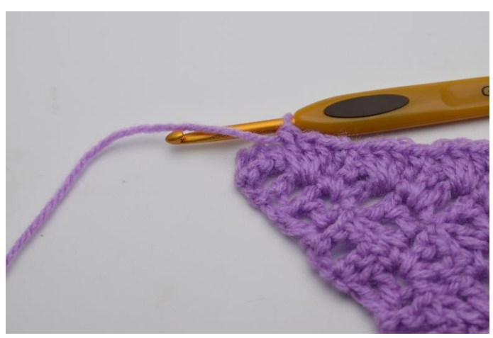
10. Repeat to the end of the row.