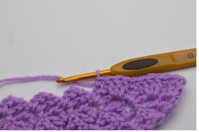
9. This is how it will look.