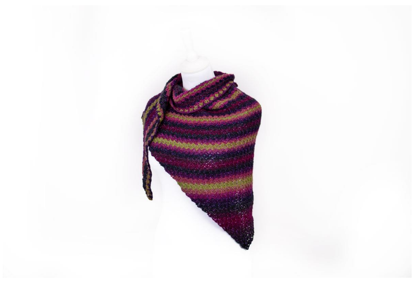
Enjoy! Love from Hobbii