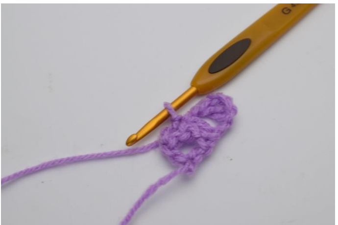
5. This is how it will look.