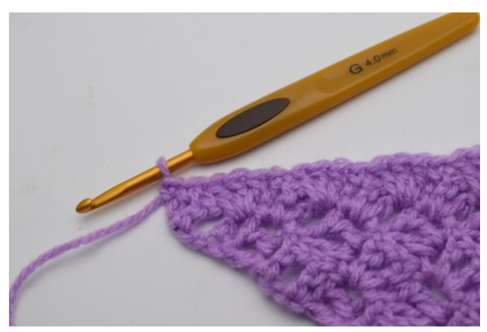
11. Finish with sc in the last dcs. Cut the yarn and weave in ends.