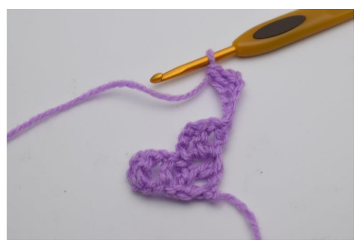
2. Work 1 dc in the 4th ch from the hook.