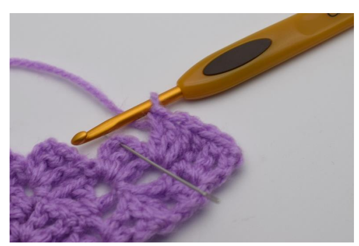
5. Skip 2 dc and work 1 sc in the chain arch.