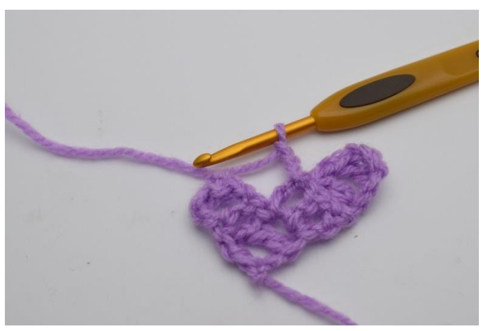
5. Ch 3.