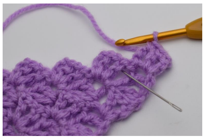
3. Now you will be working between the squares of the previous 2 rows. The needle shows where you will be working.