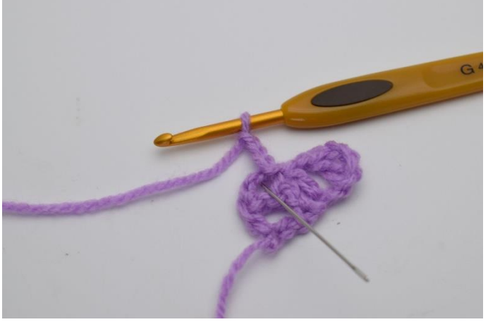
7. Work "1 dc, ch 1 and 1 dc" down into the chain arch where you just made a sl st.