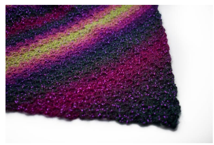
Repeat the rows until you have a total of 89 rows, or until the desired size.