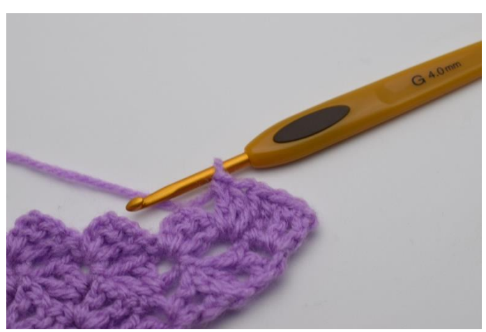
4. Work 3 dc.