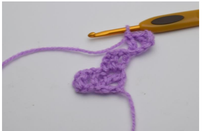
3. Ch 1 and work 1 dc in the last ch.