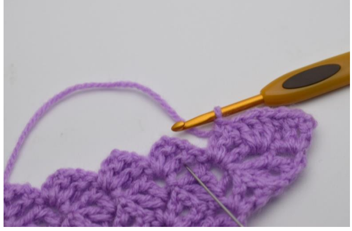
5. This is how it will look. Work 3 dc between the "squares" of the previous 2 rows. The needle shows where you will be working.