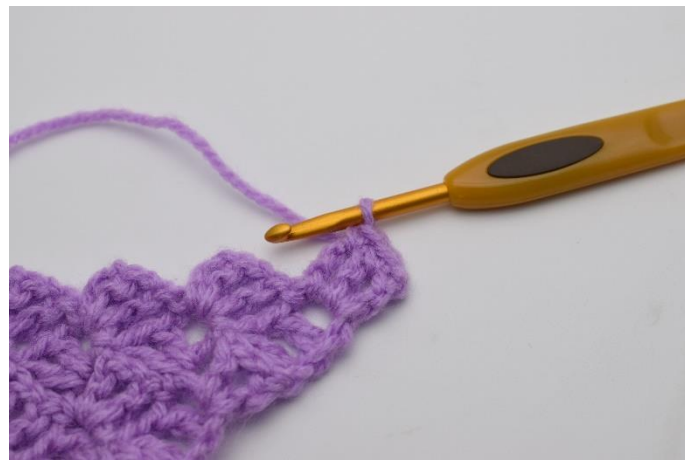
2. Work 1 sc in the 2 dc.