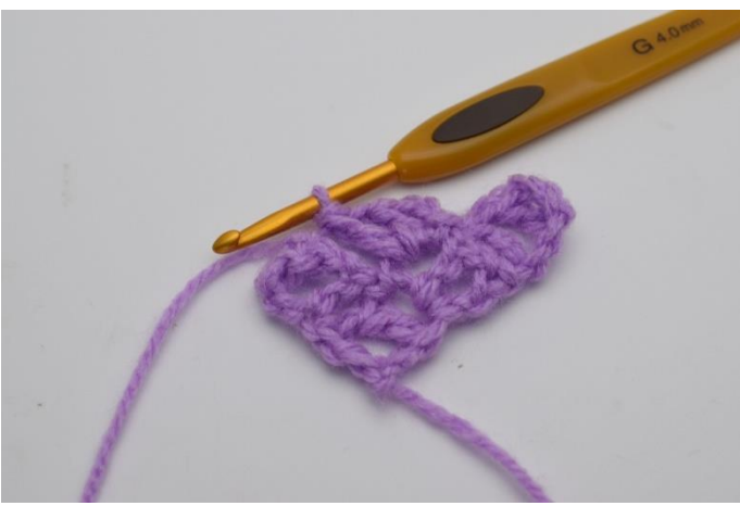
6. Work "1 dc, ch 1 and 1 dc" down into the chain arch where you just made a sl st.