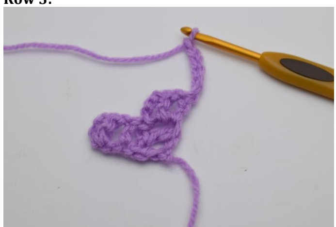
1. Ch 6 and turn.