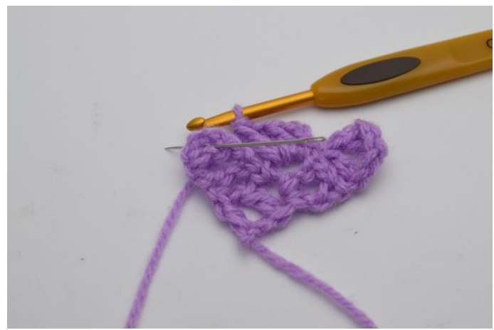
7. Work 1 sl st into the square below. The needle shows where to work the sl st.