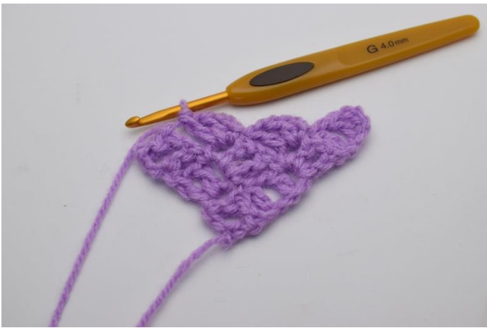
6. Ch 3 and work 1 dc, ch 1 and 1 dc down into the chain arch where you just made a sl st.