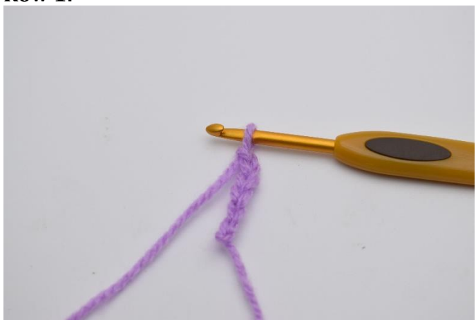
1. Ch 6 to begin.