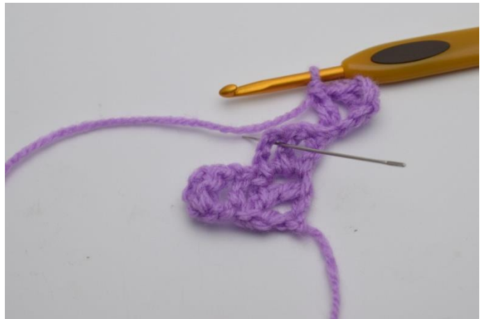
4. Work 1 sl st into the square below. The needle shows where to work the sl st.