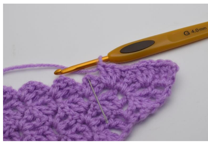
8. Skip 2 dc and work 1 sc in the chain arch.