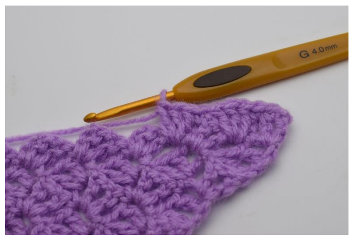
7. This is how it will look.