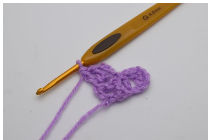
8. You have now made another "square". And you have now 2 "squares" on row 2.