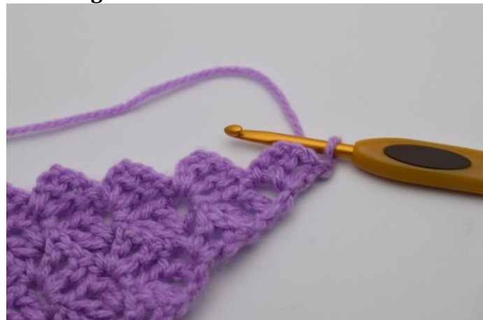
1. Ch 1 and turn.