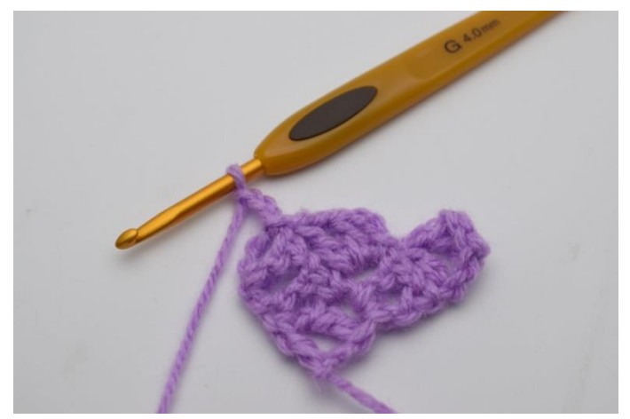
8. Ch 3.