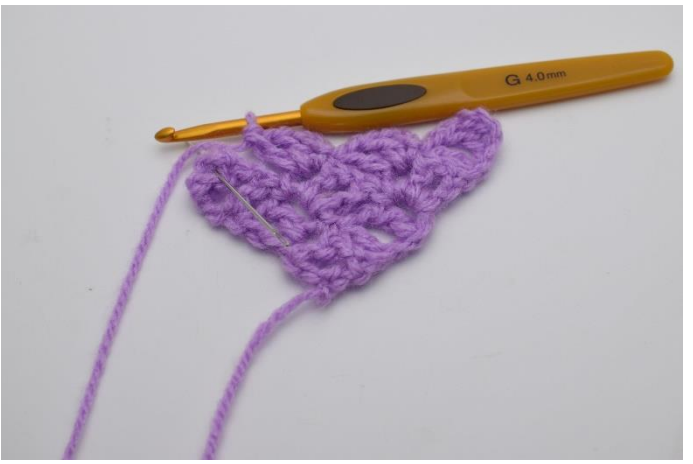
7. Work 1 sl st into the square below.