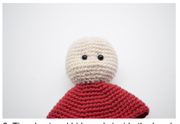
6. Tie a knot and hide ends inside the head.