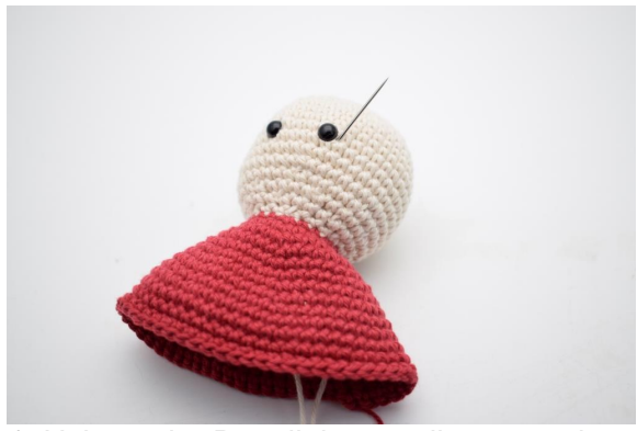
1. Using color B, pull the needle out on the right side of one eye.