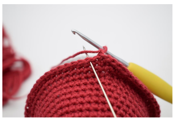
2. "Skip 1 st.