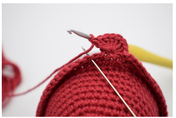
4. Skip 1 st.