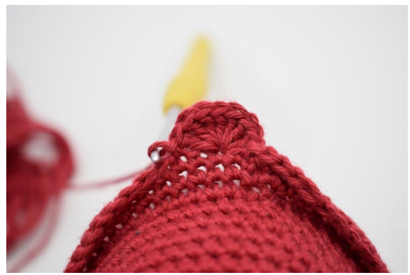
5. Work 1 sl st in the next st".