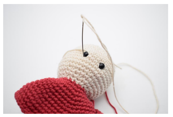
4. Insert the needle on the left side of the eye.