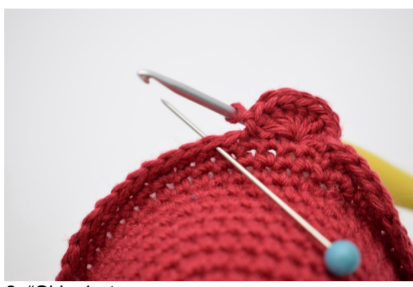
6. "Skip 1 st.