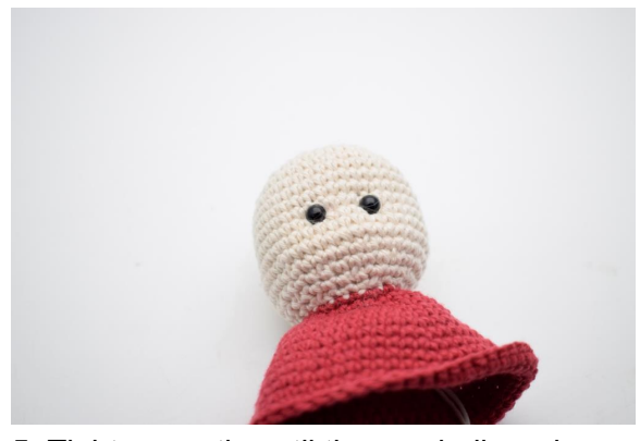
5. Tighten gently until the eye hollows have the desired shape.