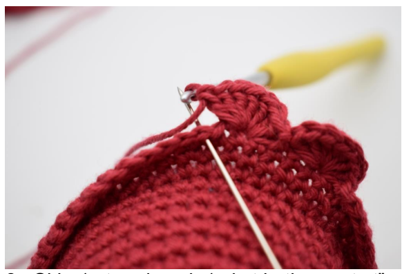
8. Skip 1 st and work 1 sl st in the next st".