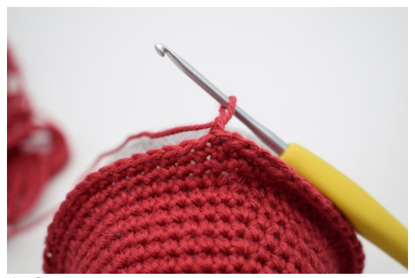
1. Ch 1,

4. Ch 1. "Skip 1 st, work 7 dc in the next st. Skip 1 st and work 1 sl st in the next st". Repeat "to" to the end of the round. End with a sl st. Cut the yarn and weave in ends.