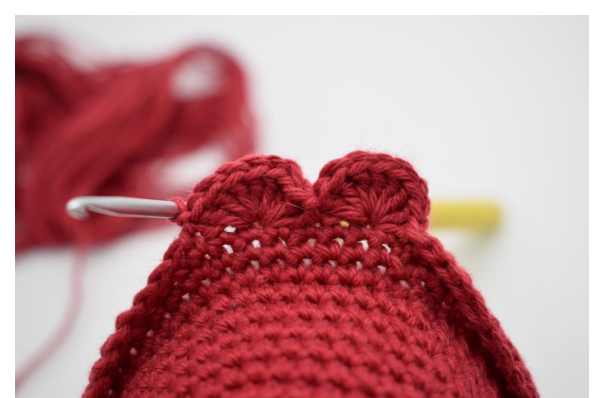
9. Like this.