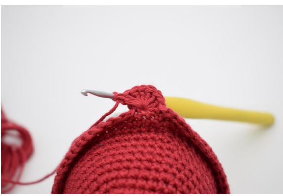
3. Work 7 dc in the next st.