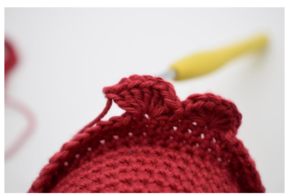
7. Work 7 dc in the next st.