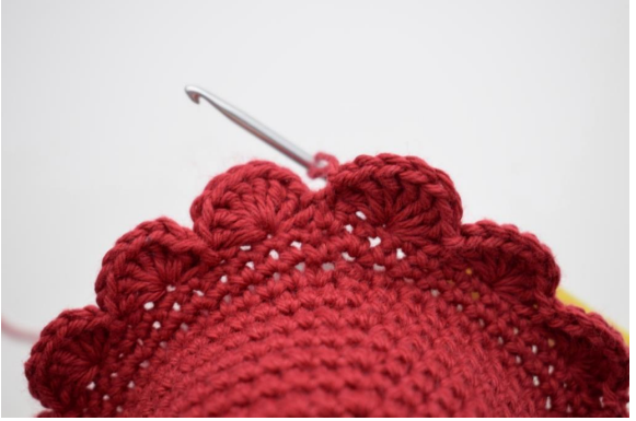
10. Repeat "to" to the end of the round. End with a sl st.