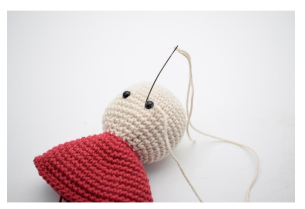
2. Insert the needle on the left side of the eye.