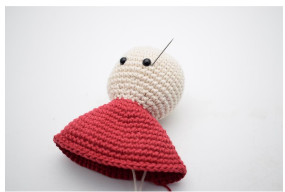
1. Using color B, pull the needle out on the right side of one eye.