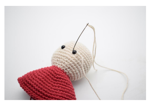
2. Insert the needle on the left side of the eye.