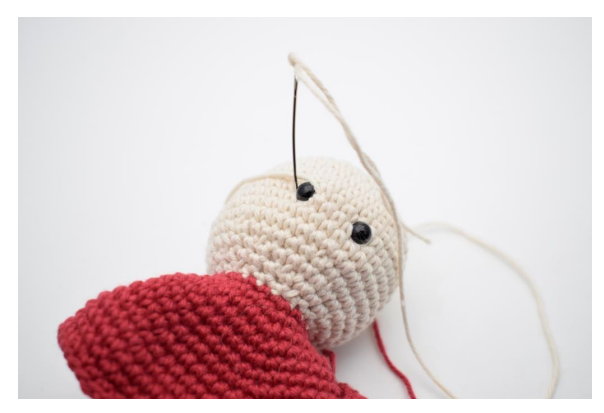
4. Insert the needle on the left side of the eye.