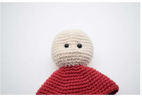
6. Tie a knot and hide ends inside the head.