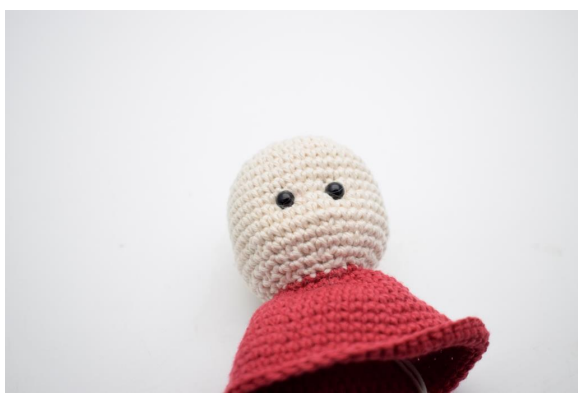
5. Tighten gently until the eye hollows have the desired shape.