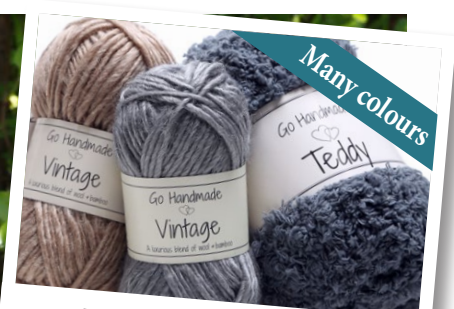
Knitted in Go handmades Teddy: 100% Polyester, 50 g/65 m and Go handmades Vintage: 70% Wool/30% Bamboo, 25 g/60 m.

YARN USAGE Teddy Grey/Beige: Vintage Grey/Brown: A few meters of black yarn for nose and mouth.