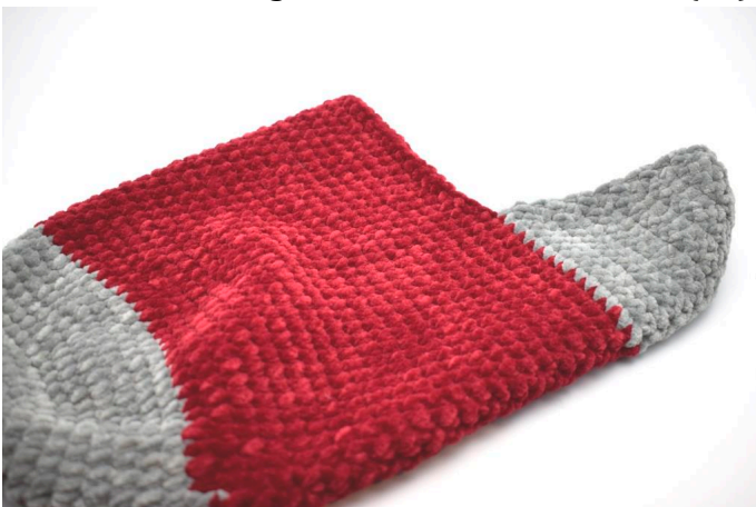
Turn the stocking.