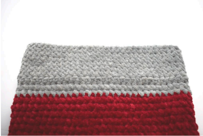
The edge is now finished.

Finish with 1 sl st, cut the yarn and weave in end.