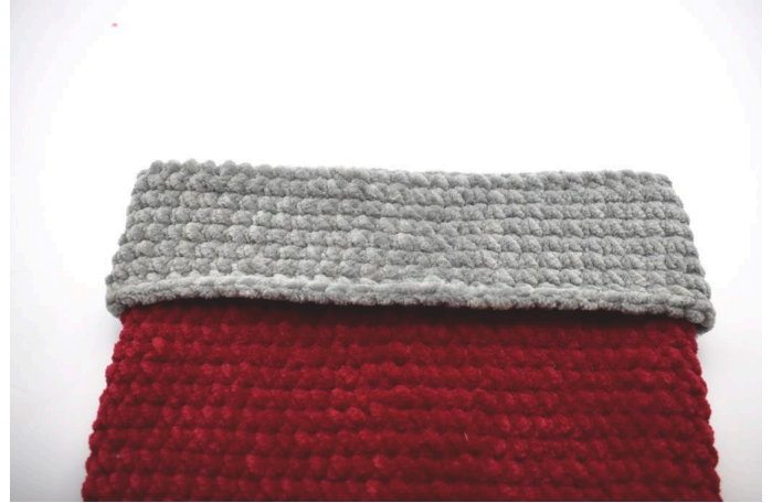
Fold the edge over the stocking.