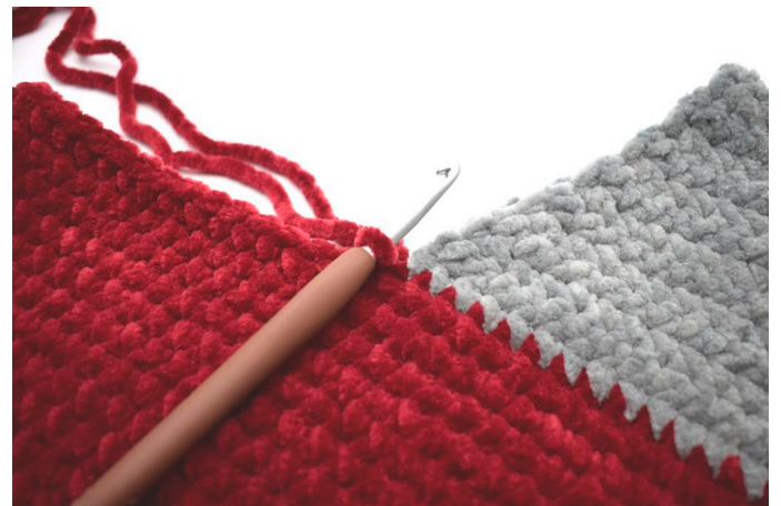
Attach the red yarn on the right side.