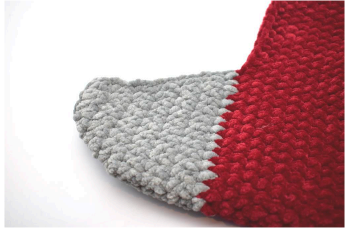
Sew the end together on the wrong side. The heel is now finished.