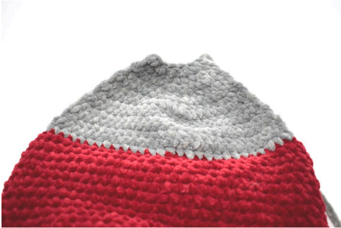
This is how the heel looks like now.