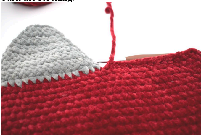
Work 1 sc until the beginning of the heel.