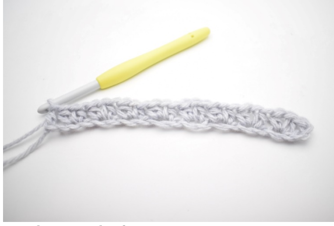
11. That was the first row.