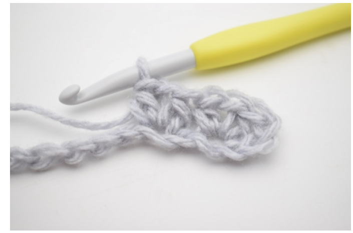
4. Skip 1 ch.

5. Work 1 hdc, ch 1 and 1 hdc in next ch.