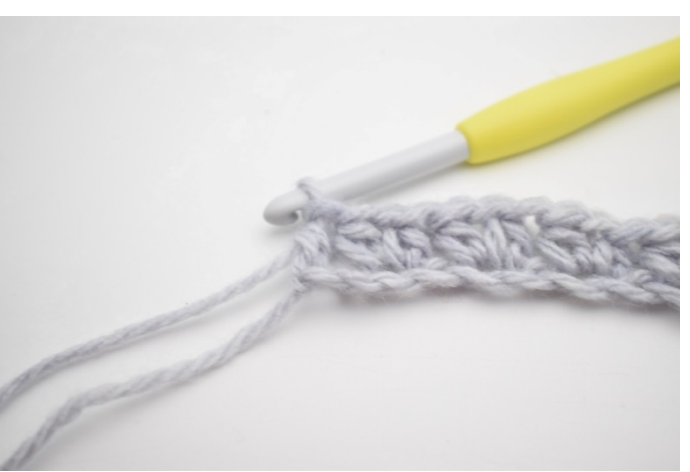
10. Like this.

9. Skip 1 ch over and work 1 hdc in last st.