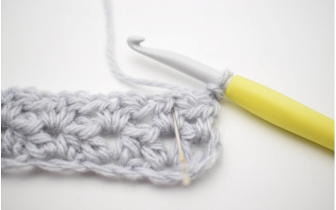
2. "Work 1 hdc, ch 1 and 1 hdc in first ch-space from previous row". The needle here shows the ch-space you need to work in.

1. Row 3 is worked as row 2. Turn dit with ch 2.