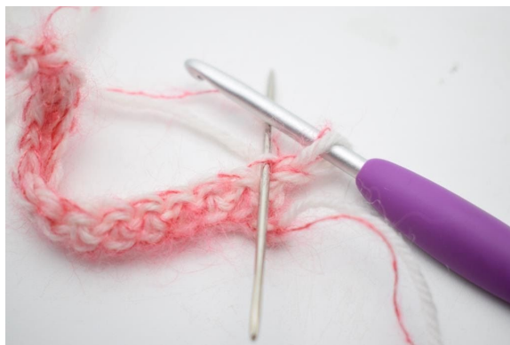
6. Work 1 sc tbl in first st. The needle shows in which loop you work your sc.