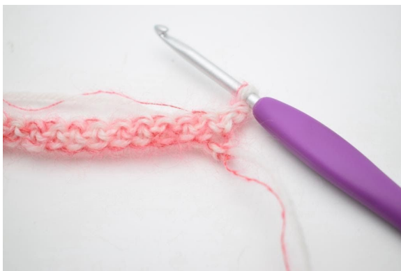
5. Turn with ch1.