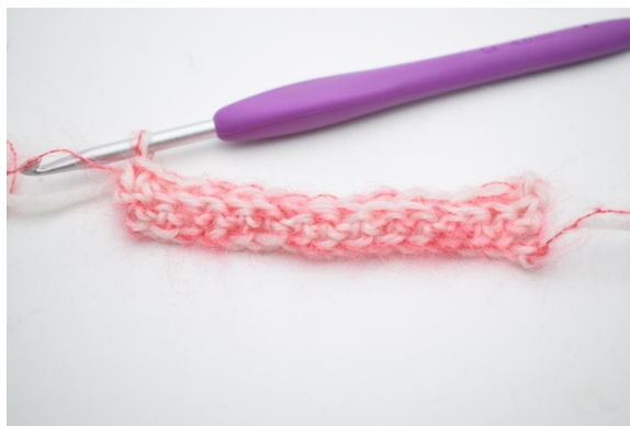
8. Work sc tbl on entire row. (23)