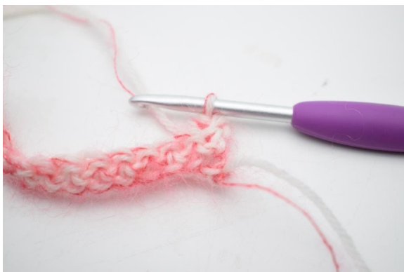
7. Like this.