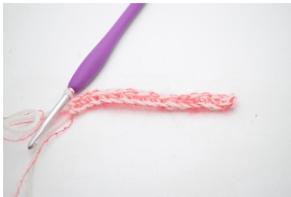
4. Work sc on entire row. (23)