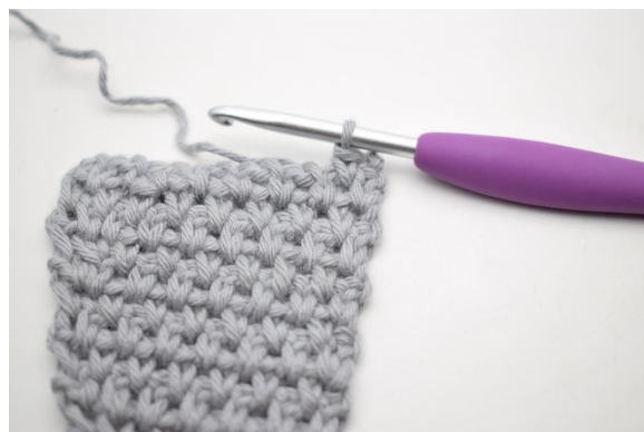
71. Work 1 sc in first ch-space.