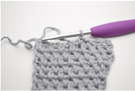
68. Like this.