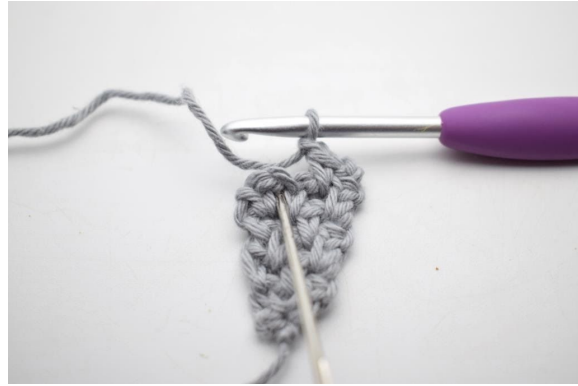
28. Ch 1 and work 1 sc in next ch-space.