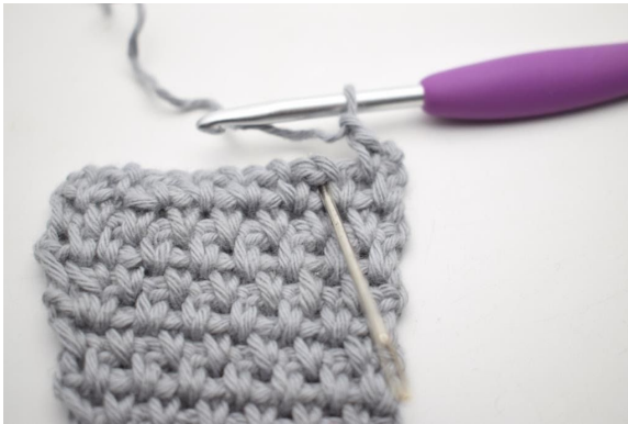
72. "Ch 1 and work 1 sc in next ch-space".