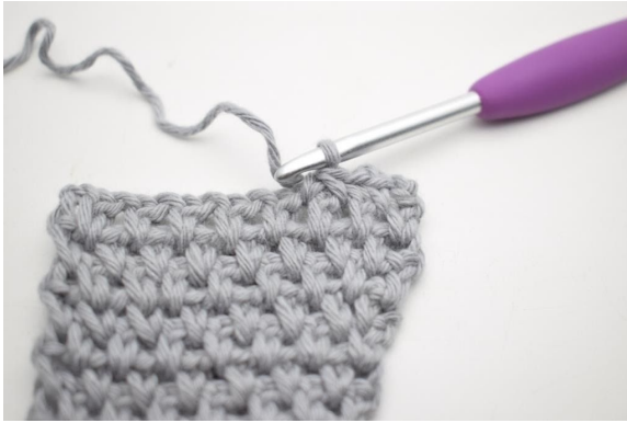
66. Like this.