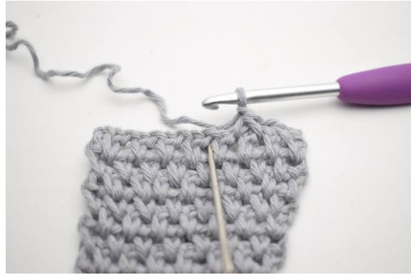
67. "Ch 1 and work 1 sc in next ch-space".