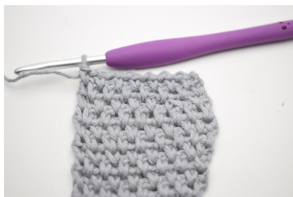
76. Work 1 sc in first ch-space. "Ch 1 and work 1 sc in next ch-space". Repeat from " to " 42 times more. (44 sc)