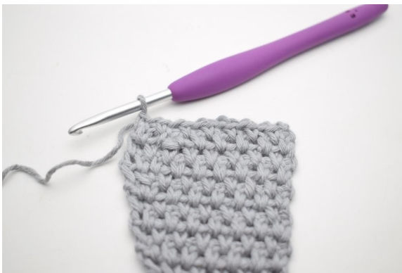
74. Repeat from " to " 42 times more. (44 sc)