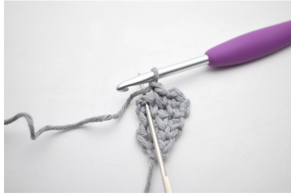
23. Ch 1 and work 1 sc in last ch-space. (3 sc)