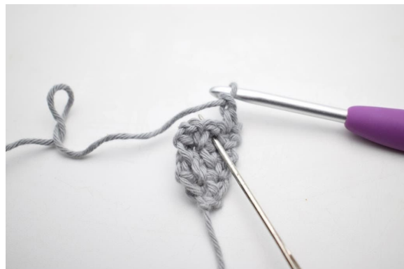
21. Ch 1 and work 1 sc in next ch-space.