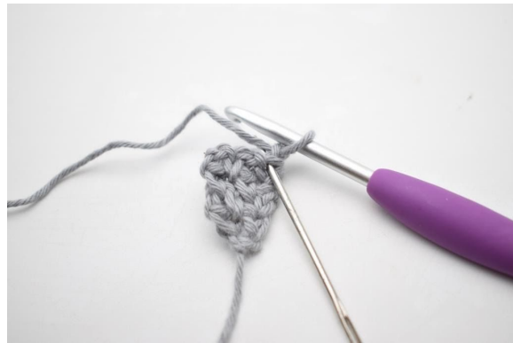
19. Work 1 sc in first st.