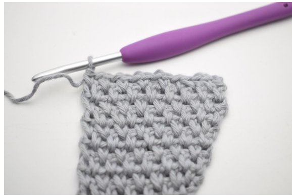
69. Repeat from "to" 41 times more. (44 sc)