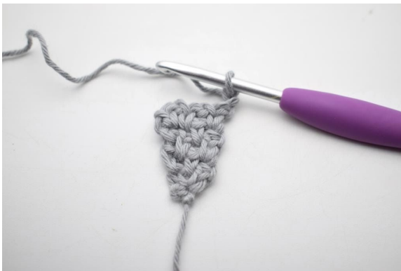
25. Turn with ch 2.