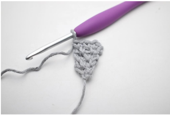
24. Like this.