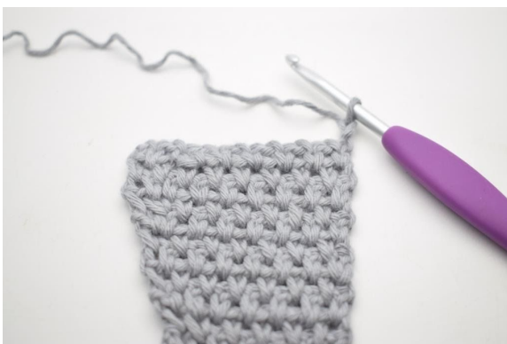
70. Turn with ch 2.