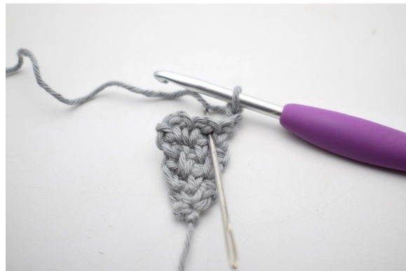
26. Work 1 sc in first ch-space.