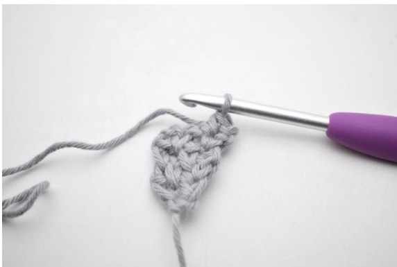
20. Like this.