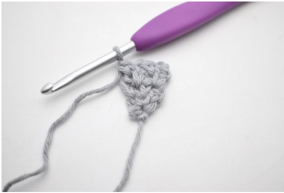
17. Like this.