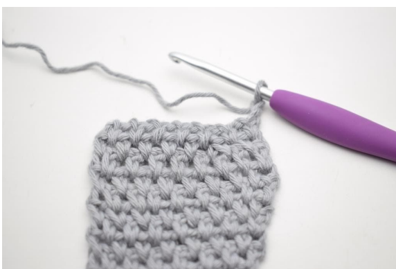
75. Turn with ch 2.