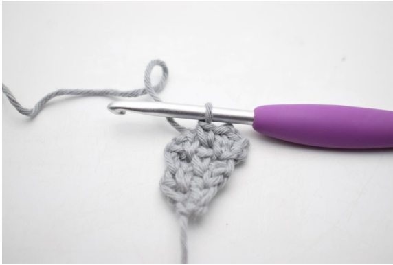
22. Like this.