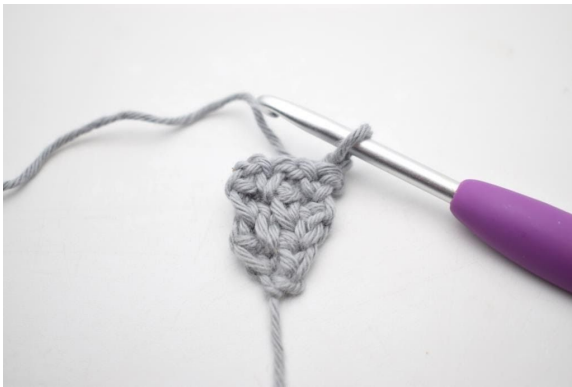
18. Turn with ch 1.