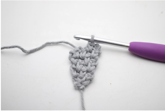
27. Like this.