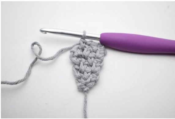
29. Like this.