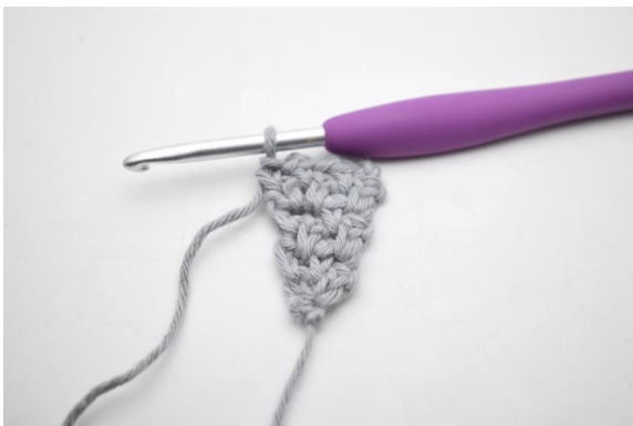
31. Like this.