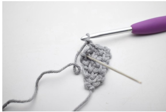
30. Ch 1 and work 1 sc in last st. (3 sc)