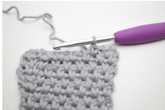
73. Like this.