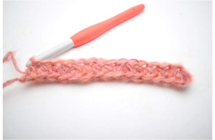
4. Work hdc on entire row. (180)