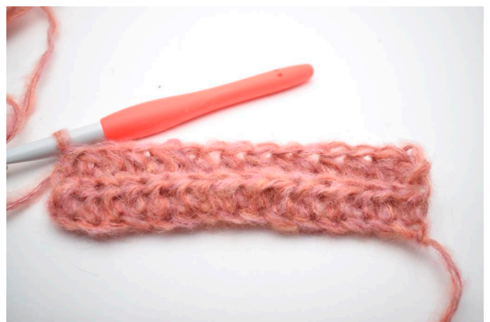
4. Work hdc tbl on entire row. (180)