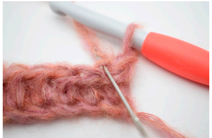
2. Work 1 hdc tbl. The needle shows in which loop you work your hdc.