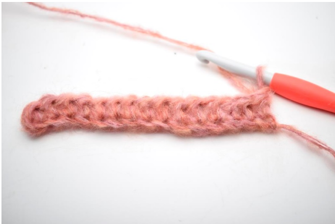
1. Turn with ch1.