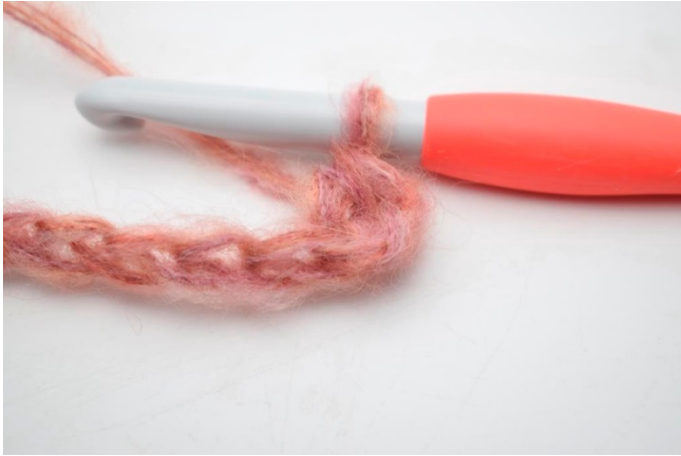
3. Like this.