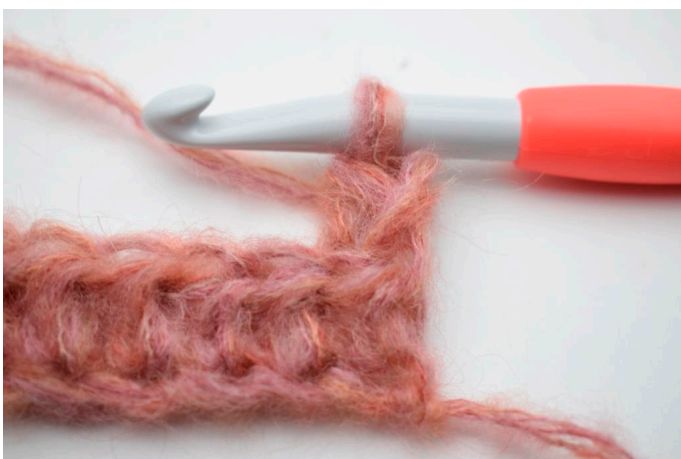
3. Like this.