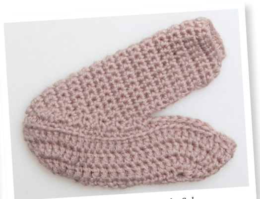
The finished top piece on the Sole.

Start here on the 10th row of the Top Piece.