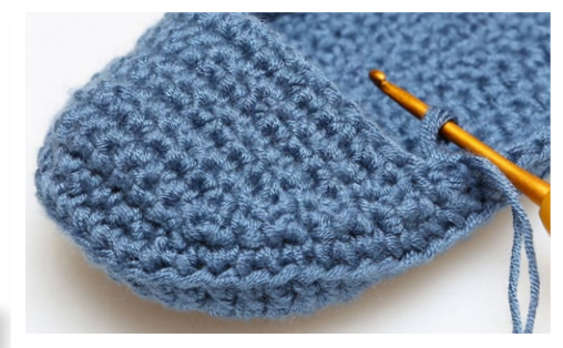
Start here on the 10th row of the Top Piece.

11.) Start in 2nd st, 15 dc, *skip 1 st, 1 dc* x 2, turn (17) 12.) Start in 2nd st, 16 dc, *skip 1 st, 1 dc* x 2, turn (18) 13.) Start in 2nd st, 17 dc, *skip 1 st, 1 dc* x 2, turn (19) 14.) Start in 2nd st, 18 dc, *skip 1 st, 1 dc* x 2, turn (20) 15.) Start in 2nd st, 19 dc, *skip 1 st, 1 dc* x 2, turn (21) 16.) Start in 2nd st, 20 dc, *skip 1 st, 1 dc* x 2, turn (22)17.) Start in 2nd st, 21 dc, *skip 1 st, 1 dc* x 2, turn (23)Start in 2nd st, 21 dc, 1 t-ch 18.) (21)19. - 31.) 21 dc, 1 t-ch (21)32.) 21 dc (21)Cut yarn.