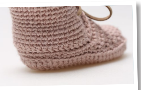
Heel Cap sewn onto the Sole.