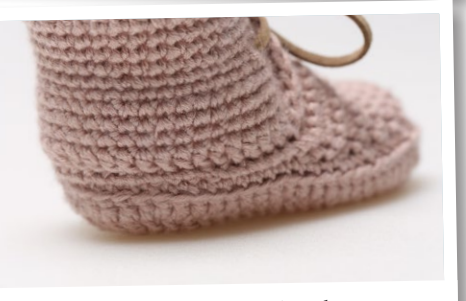
Heel Cap sewn onto the Sole.

The Heel Cap is sewn onto the Sole into the front loops.