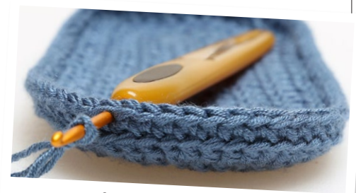
Start here on the Top Piece.