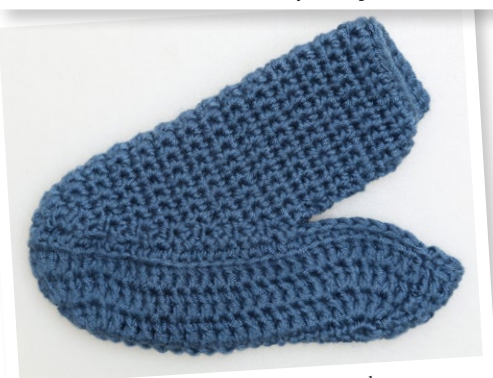
The finished Top Piece on the Sole.