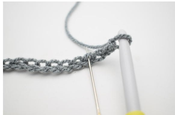
2. Sc into the 4th st from the hook.