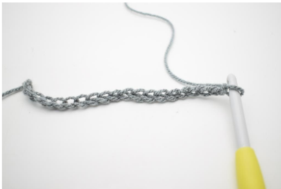
1. Ch 196.