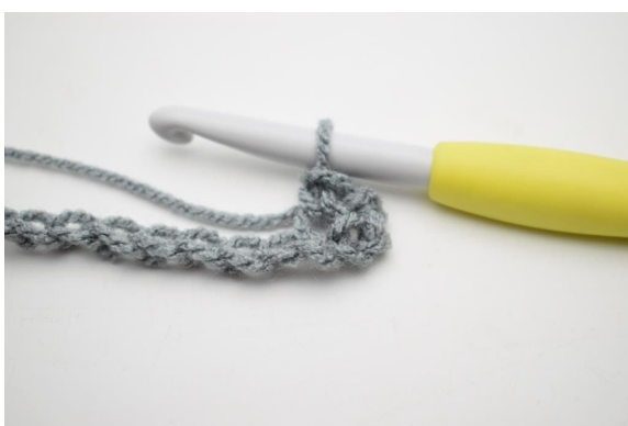
3. Like so.