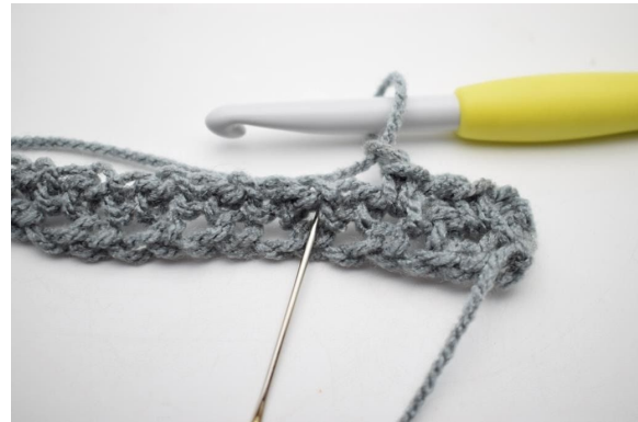
6. * ch 1 and sc into the next ch-sp *