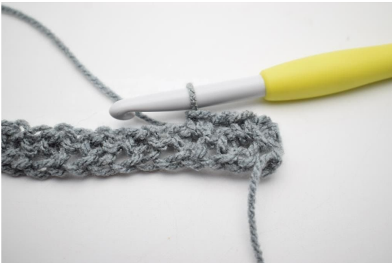
5. Like so.