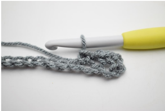
5. Like so.