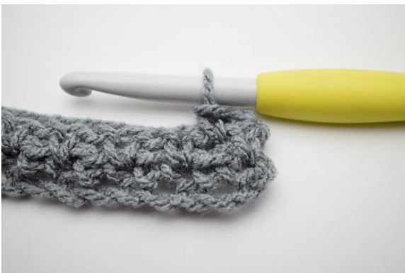
3. Like so.