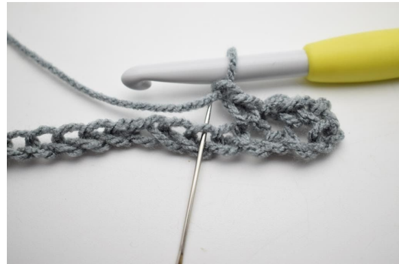
6. * ch 1, skip 1 st and sc into the next *.