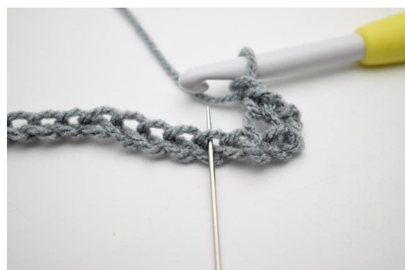
4. * ch 1, skip 1 st and sc into the next *.