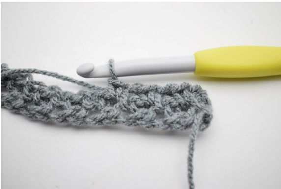
7. Like so.