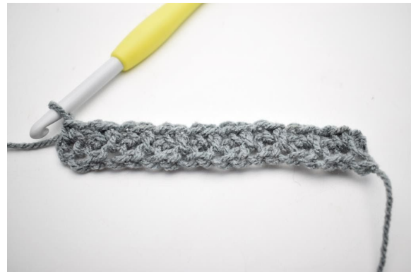
8. Repeat between ** until end of row.