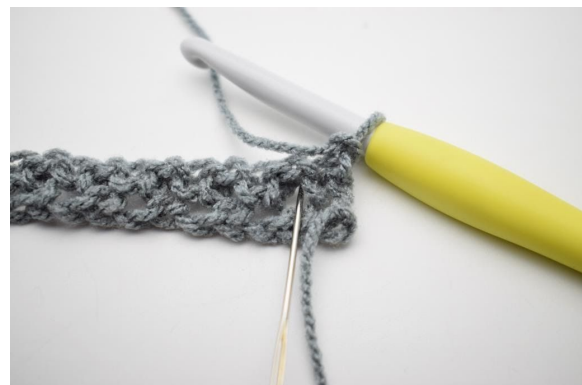
2. Sc into the first ch-sp.