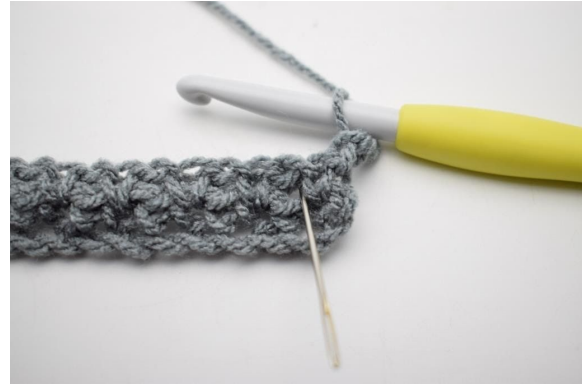
2. Sc into the first ch-sp.