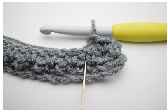
4. * ch 1 and sc into the next ch-sp *.