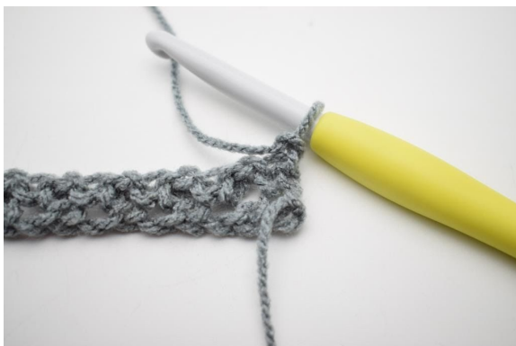
1. Turn and ch 2.