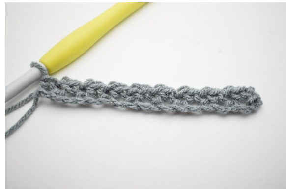
8. Repeat between ** until end of row.