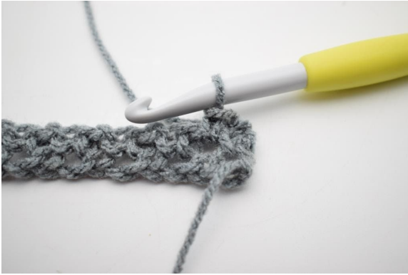
3. Like so.