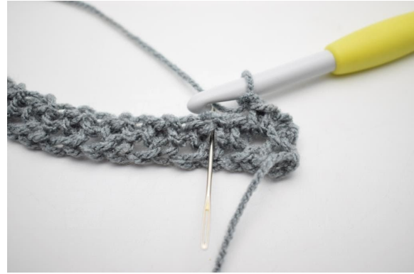
4. * ch 1 and sc into the next ch-sp *