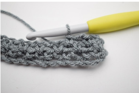
5. Like so.