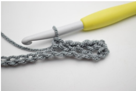
7. Like so.