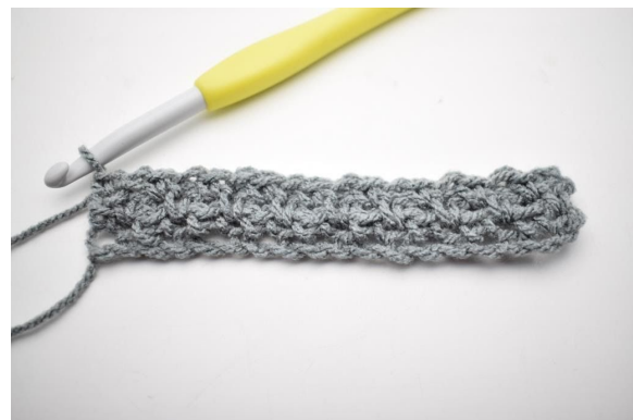
6. Repeat between ** until end of row.