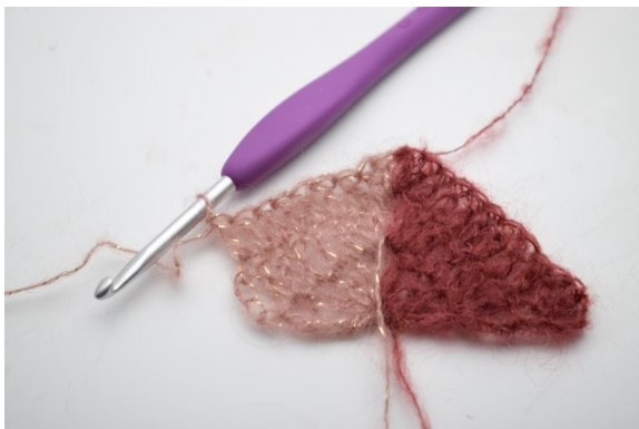
23. 1 dc in each of the next 7 sts.