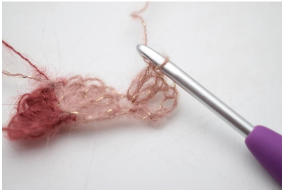
7. Like so.