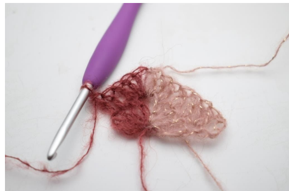
12. 1 dc in each of the next 3 sts.