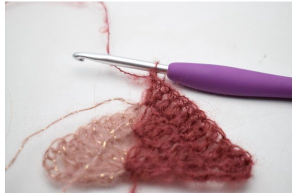
20. Like so.