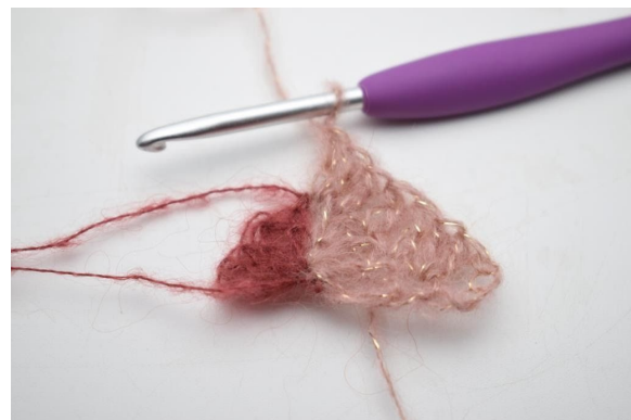
10. Like so.