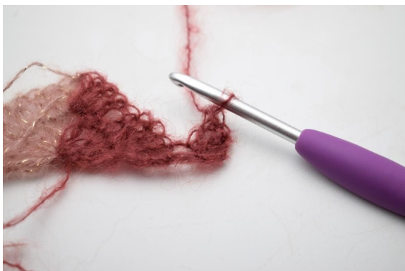
17. Like so.