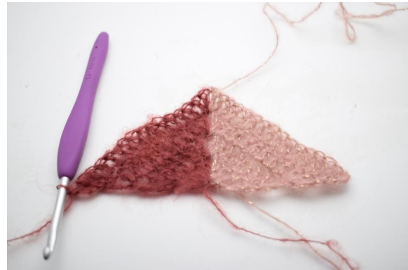
31. Make 2 dc and 1 tr in the last st.