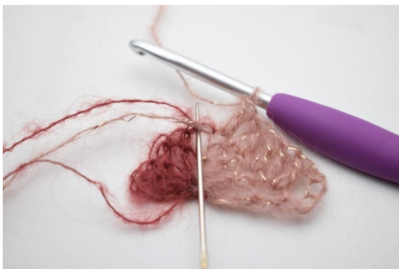
9. Make 2 dc and ch 1 in the ch-sp.