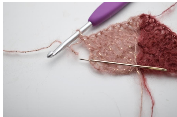
24. Make 2 dc and 1 tr in the last st.