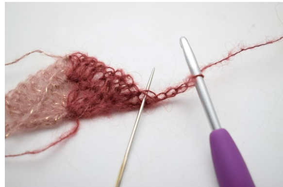
16. Work 2 dc in the first st.