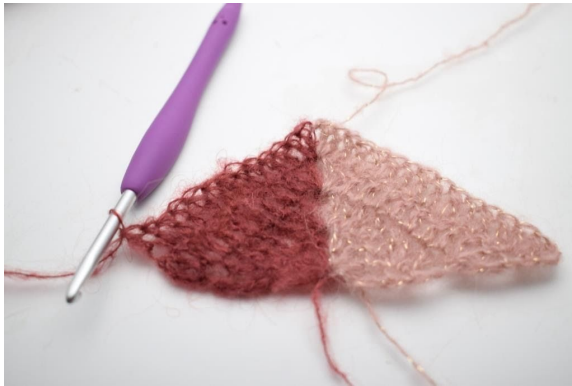
30. 1 dc in each of the next 11 sts.