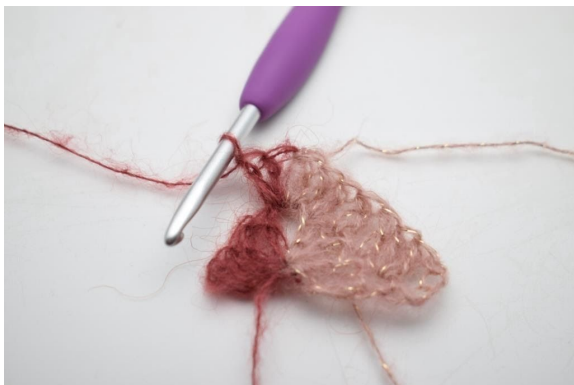
11. Switch to col. 1. Ch 1 and make another 2 dc into the ch-sp.