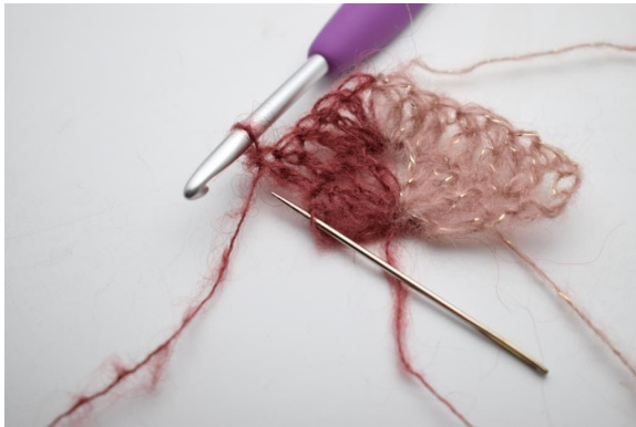
13. Make 2 dc and 1 tr in the last st.