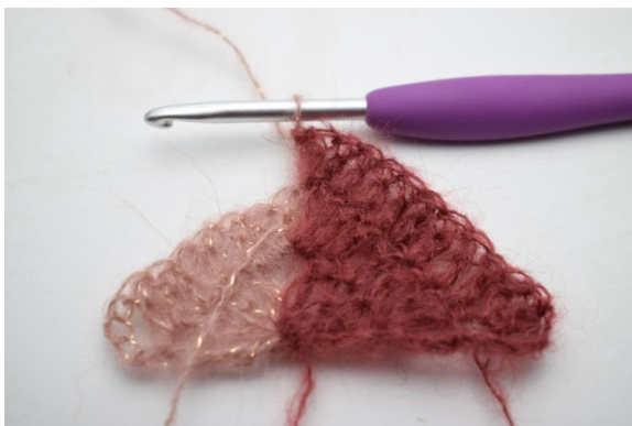
21. Switch to col. 2. Ch 1 and make another 2 dc into the ch-sp.