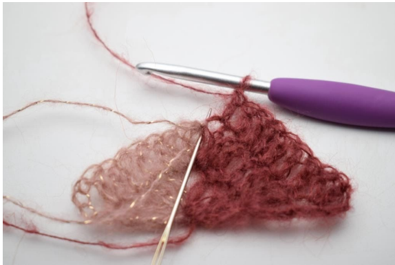
19. Make 2 dc and ch 1 in the ch-sp..