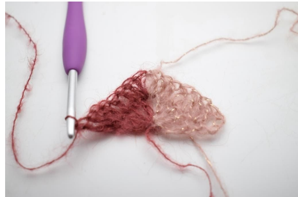
14. Like so.