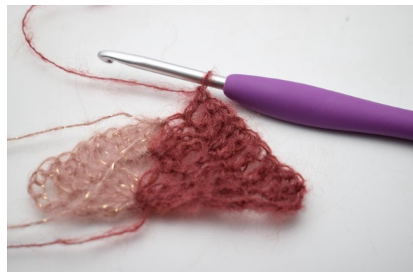
18. 1 dc in each of the next 7 sts.