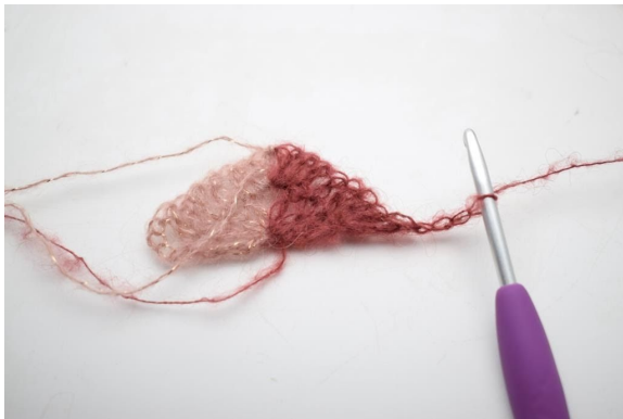
15. Turn and ch 4.