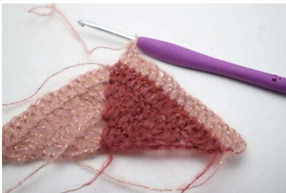
34. 1 dc in each of the next 15 sts.