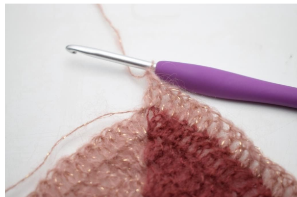
35. Make 2 dc and ch 1 in the ch-sp.