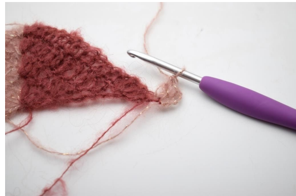
33. Switch to col. 2. Ch 4. Work 2 dc in the first st.