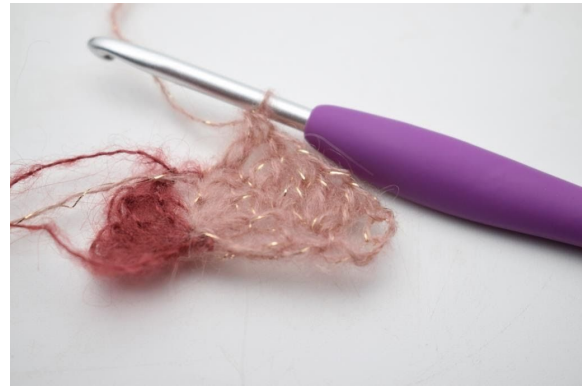
8. 1 dc in the next 3 sts.