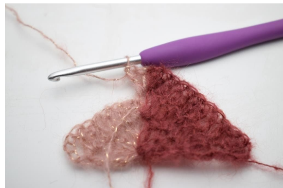
22. Like so.