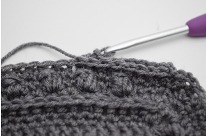
2. Work bp-hdc in all of the 170 sts on all 4 sides.