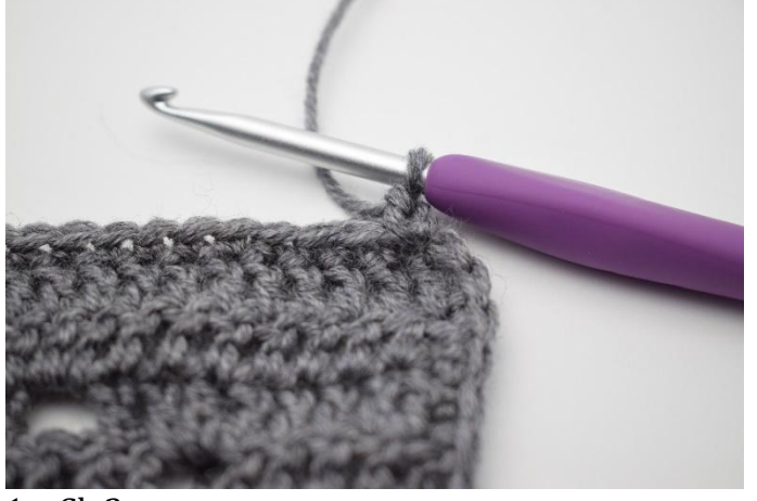
1. Ch 2.