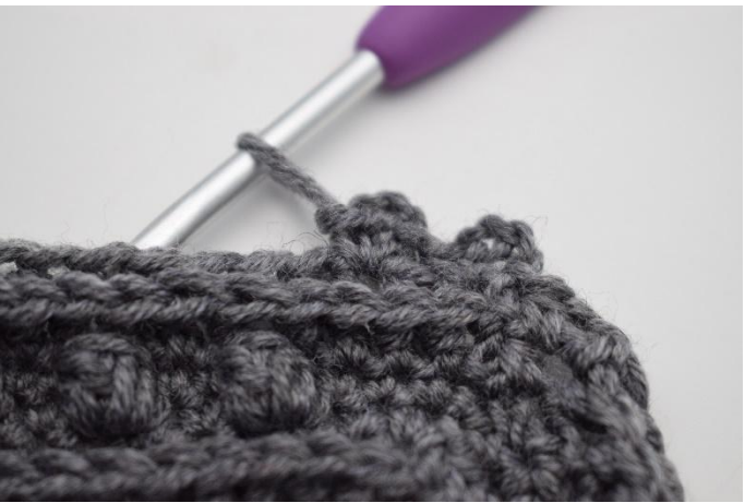
4. Like this.