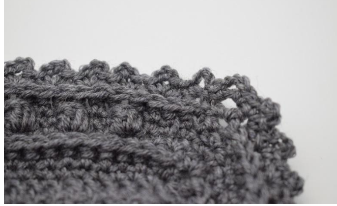
7. Finish with 1 ss.