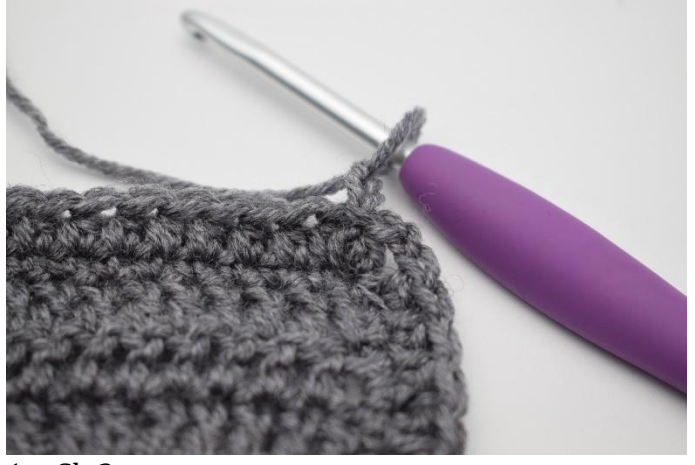
1. Ch 2.