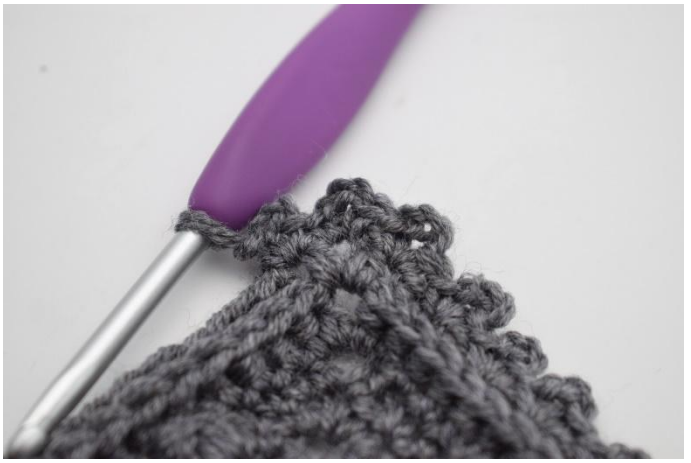
6. In each corner, work 1 sc, ch 3 and 1 sc.