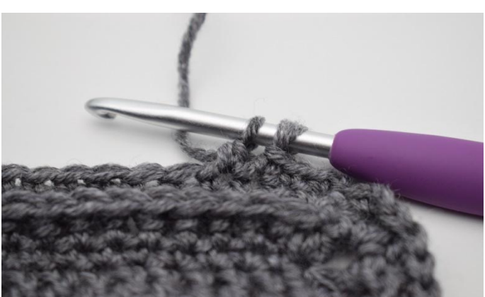
2. Work 1 bs in the next s. A bs consists of 4 unfinished dc that in the end are worked together into bobble. This is done in the following way: Yarn over, insert your hook through a s, and bring back the yarn . Yarn over and pull through 2 loops. You should now have 2 loops on your hook, and you have crocheted 1 unfinished dc.