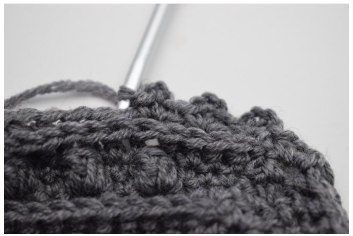
5. Repeat from "to" around.