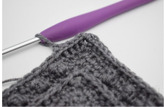
3. In the corner ch space, work 1 hdc, ch 2 and 1 hdc.