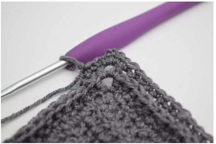
2. In the corner ch spaces, work 1 sc, ch 2 and 1 sc.

1. Ch 1, work sc in all of the 164 sts on all 4 sides.