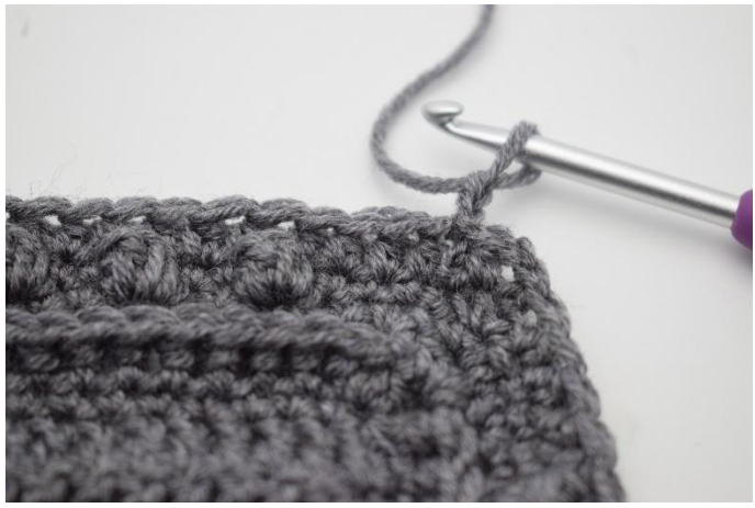
1. Ch 2,