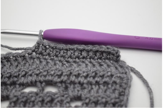
2. Work 160 hdc on all 4 sides. In the corners, work 1 hdc, ch 2 and 1 hdc.