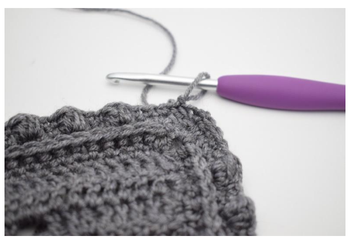
10. (Work 1 sc in the next 3 sts. Work " 1 bs in the next s, 1 sc in the following 2 sts". Repeat from "to" a total of 53 times. Work 1 bs in the next s, 1 sc in the last 3 sts. In the corner ch space, work 1 sc, ch 2 and 1 sc). Repeat from (to) on all 4 sides, finish with 1 ss.

9. Work 1 bs in the next s, 1 sc in the last 3 sts. In the corner ch space work 1 sc, ch 2 and 1 sc.