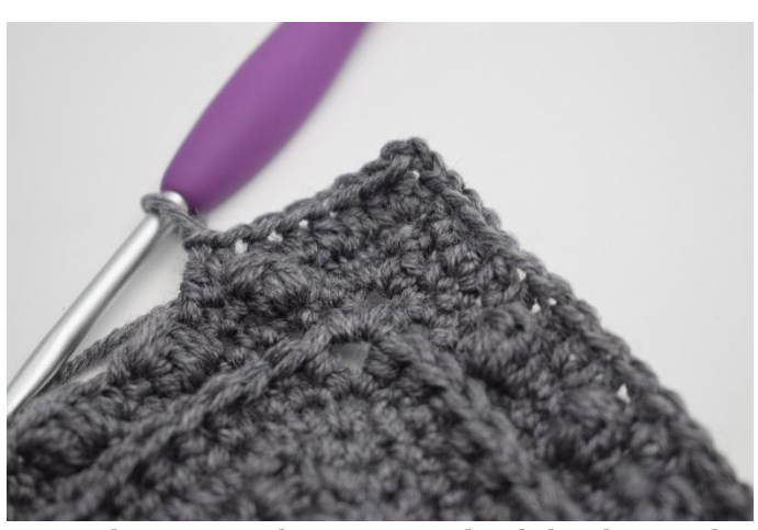
2. In the corner ch space, work 1 hdc, ch 2, and 1 hdc.