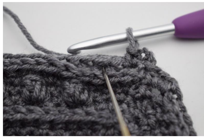
3. "Skip 1 s, and work 1 sc, ch 3 and 1 sc in between the next 2 hdc".