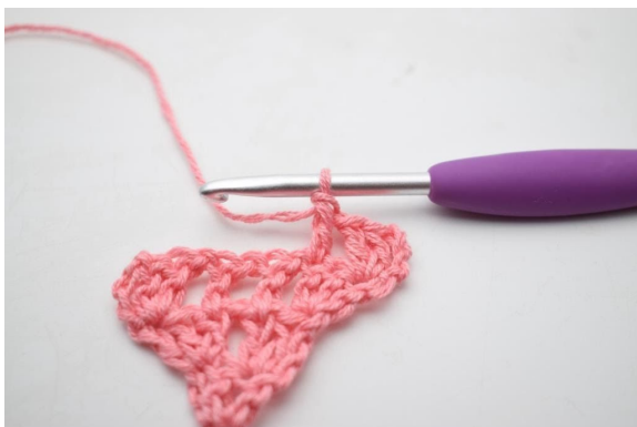
5. Like so.