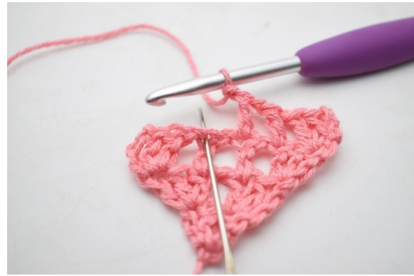
8. *Ch 1, skip 1 st, and dc in the next st*.