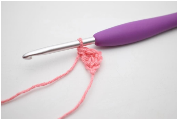
3. Like so. (3)