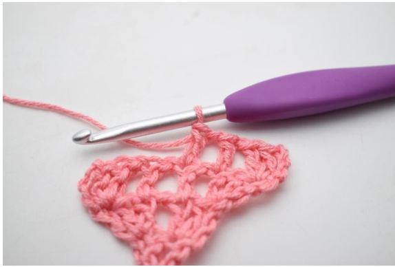
7. Like so.