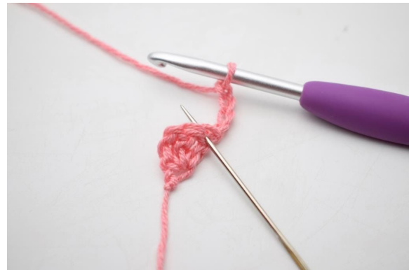
2. Make 2 dc in the first st.