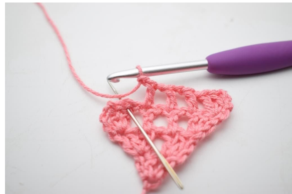
10. *Ch 1, skip 1 st, and dc in the next st*.