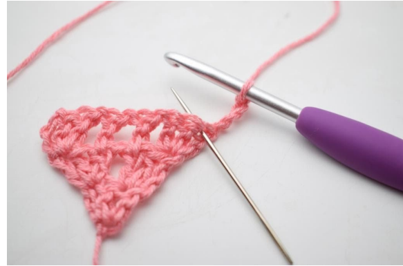
2. Make 2 dc in the first st.