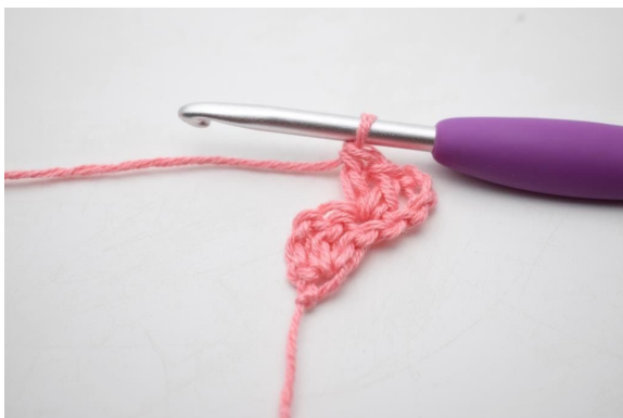
3. Like so.