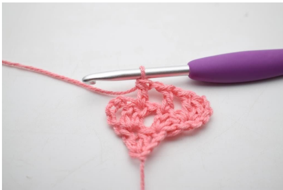
7. Like so.