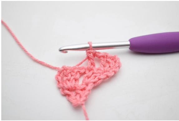
5. Like so.