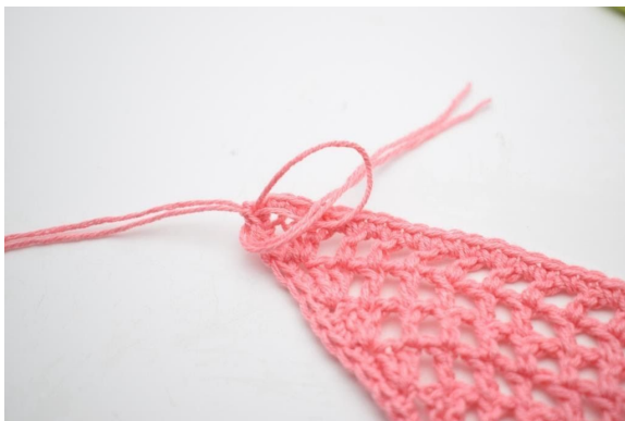
9. Pull the ends through the loop.