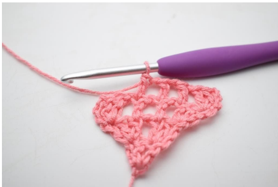
9. Like so.