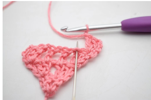
4. *Ch 1, skip 1 st, and dc in the next st*.