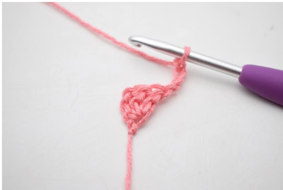
1. Turn and ch 4.