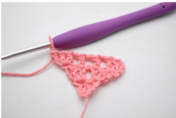
9. Like so. (11)