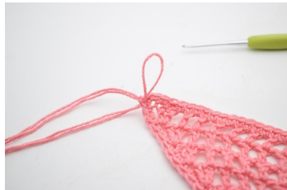
8. Pull the yarn through to make a loop.