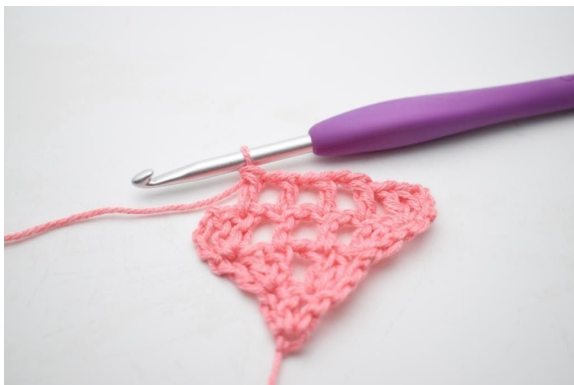
11. Like so.