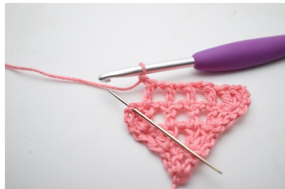
12. Ch 1, skip 1 st and make 3 dc in the last st.