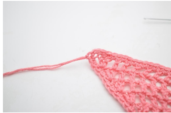
6. And tighten lightly.