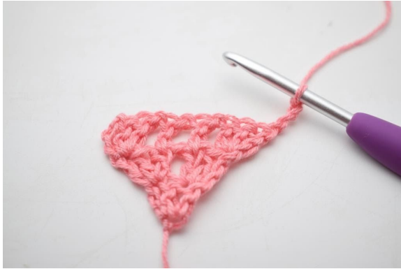
1. Turn and ch 4.