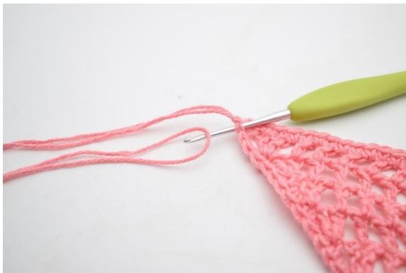
7. To make the fringe dense, follow the pattern of “add 2 strands of yarn to the first st, 1 strand in the next”. So, repeat the method to add another strand to the st. Thread the hook through the st and fold a strand of yarn in half