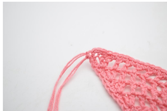
10. Tighten lightly.