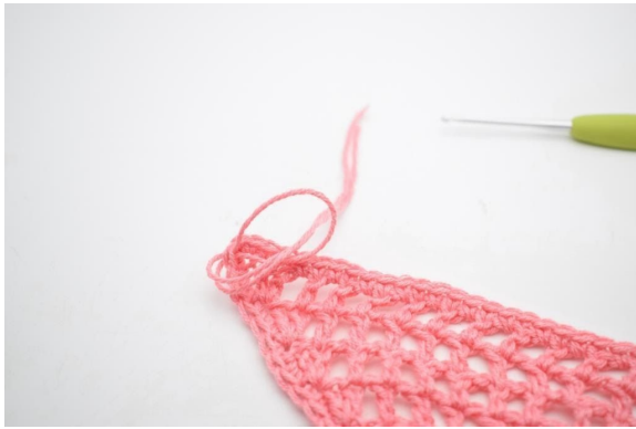
5. Pull the ends through the loop.