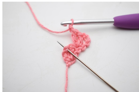
4. Ch 1, skip 1 st and make 3 dc in the last st.