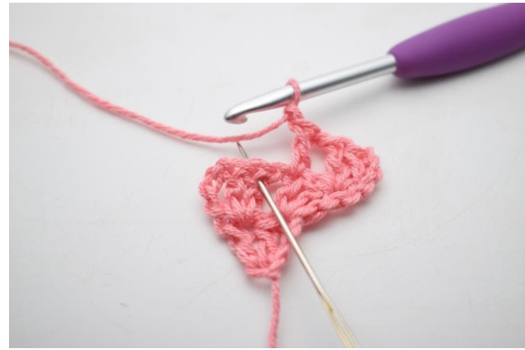
6. *Ch 1, skip 1 st, and dc in the next st*.