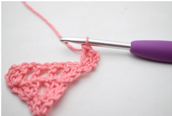
3. Like so.