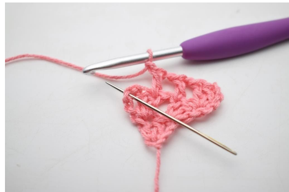
8. Ch 1, skip 1 st and make 3 dc in the last st.