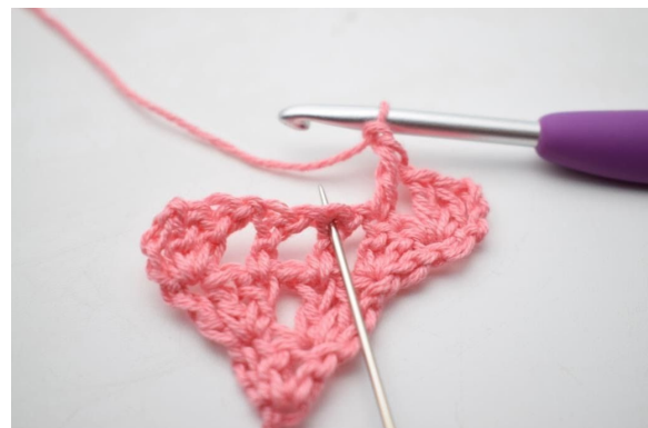
6. *Ch 1, skip 1 st, and dc in the next st*.