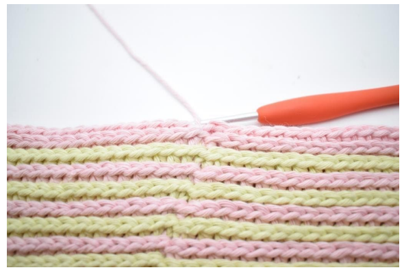
2. Work sc in b-bl around. Finish with 1 b-sl st. (121)