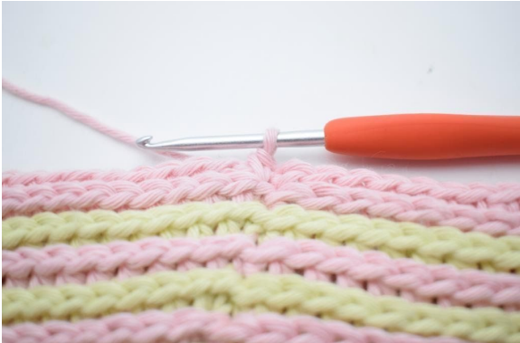
4. Like this. You've now made 1 lsc.

3. Work lsc to where your other D-ring should be. A lsc is a regular sc that is worked into the st below. The needle here shows where your first lsc should be.