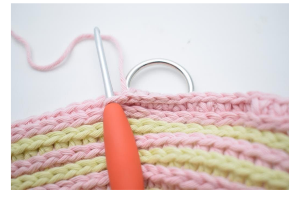
9. Here it is crocheted on over 5 sts using lsc.