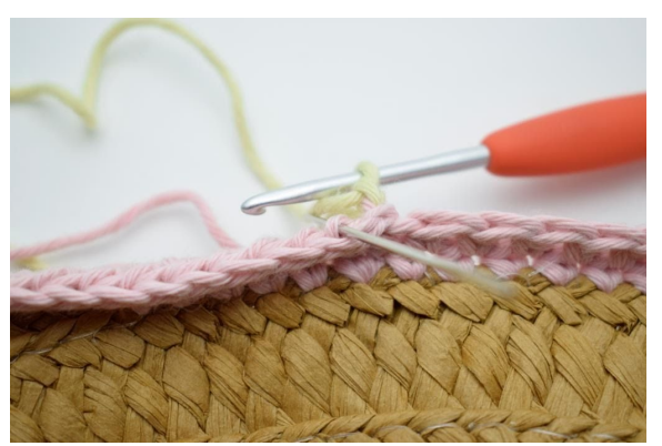
2. Now work hdc in b-bl. Bottom back loop of stitch is the loop that appears when you flip your work a little bit. It is right behind the 2 loops you normally work through. The needle here shows where your first hdc is to be made.