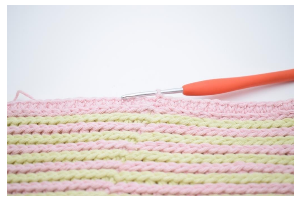
10. Work lsc around. Finish with 1 sl st. (121)