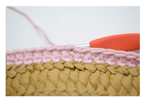
5. Pull through. You've now made 1 b-sl st. (121)