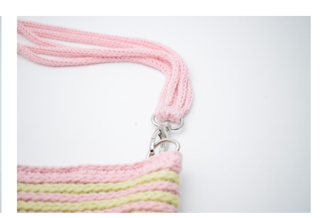
6. Lock the lobster lock in the D-ring on the bag.