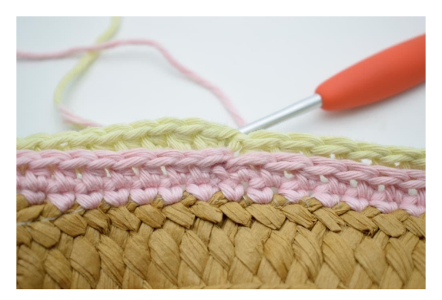
9. Like this. (121)