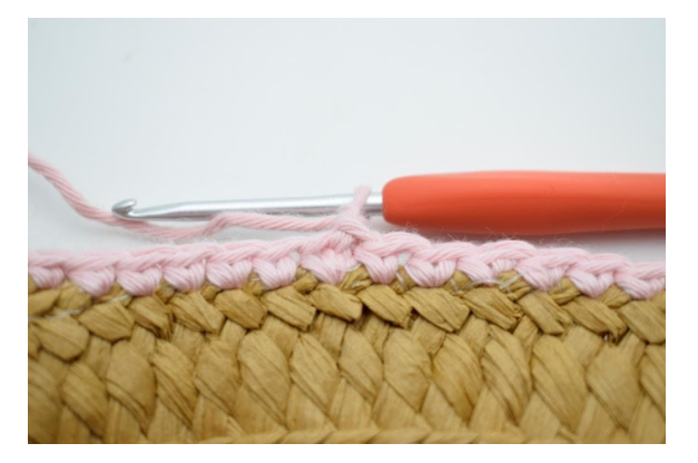
1. Make 2 ch.