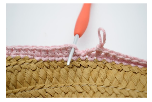
3. Finish with 1 b-sl st. A b-sl st is worked from behind in stead of from the front like a regular sl st. Let go of the st and insert your hook in 2nd ch from the beginning of the round from the back as in this picture.