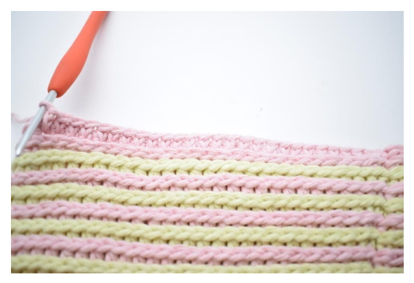
5. Repeat this to where your first d-ring should be.