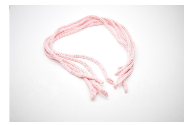
1. Using the knitting mill and Rainbow 8/4, knit 5 strings of approx. 25.6"/65 cm each.