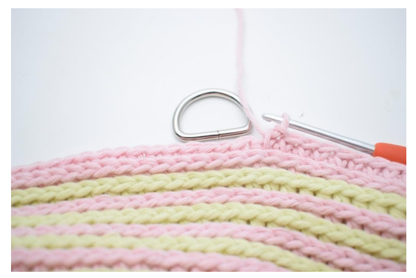
6. Here it is crocheted on over 5 sts using lsc.