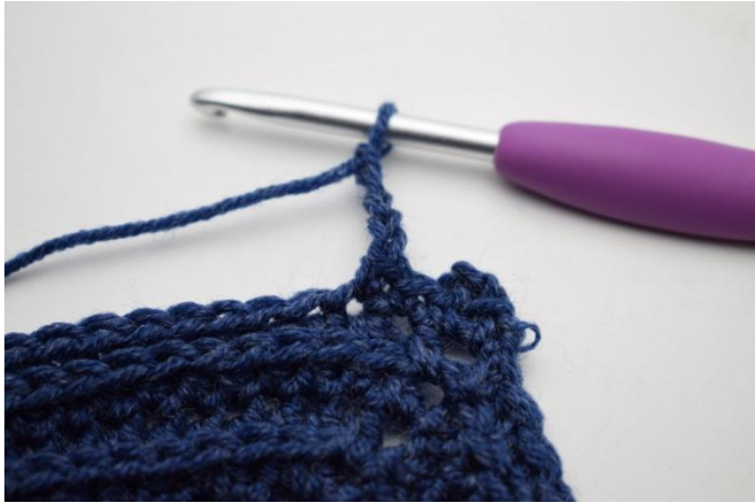
9. Ch 4.