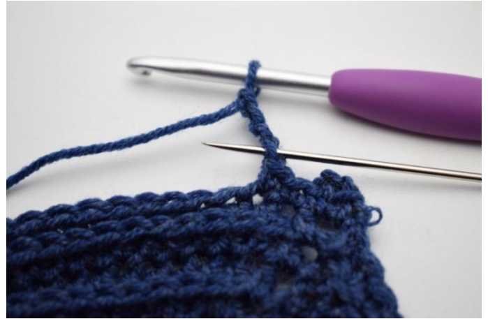
Work 1 ss in the 1st ch.