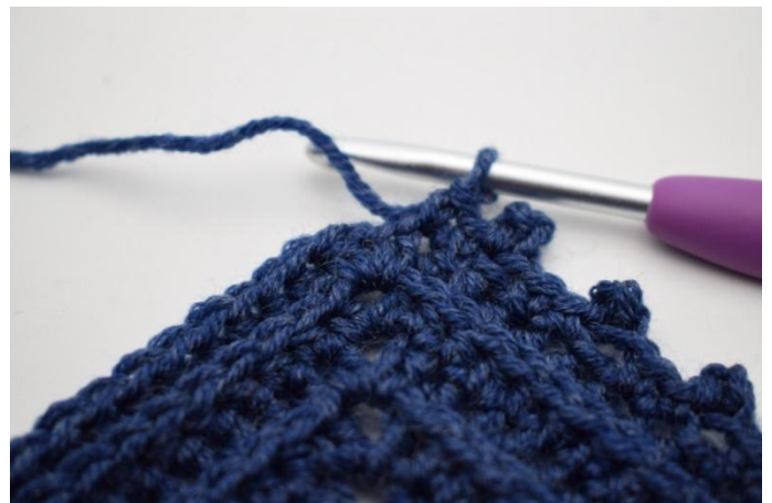
19. Work 1 sc in the last s.