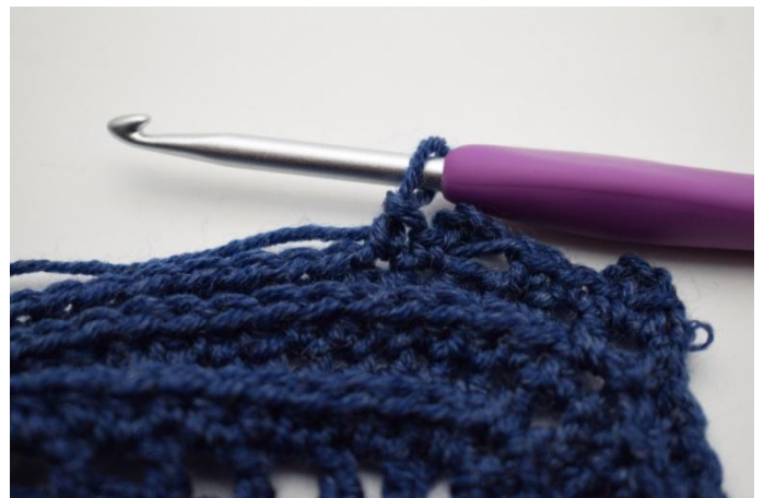
13. "Work 1 sc in the next s.