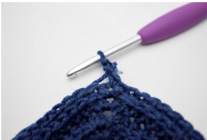
5. Like this.