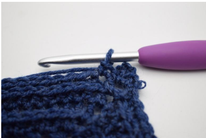
7. (Work 1 sc in the first s.