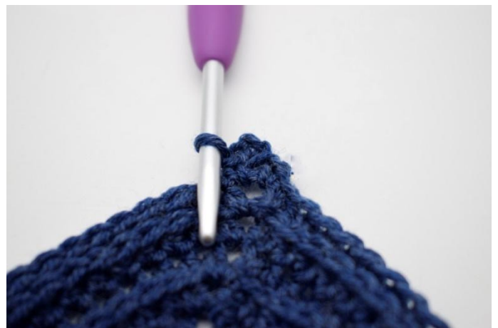
6. Work 1 sc in the ch-space.