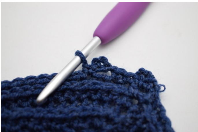
12. Like this.