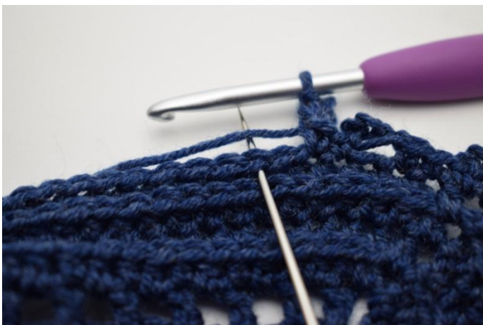
16. Skip 1 s and work 1 sc in the next s”.