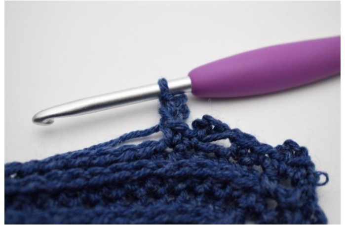
15. Work 1 ss in the 1st ch.