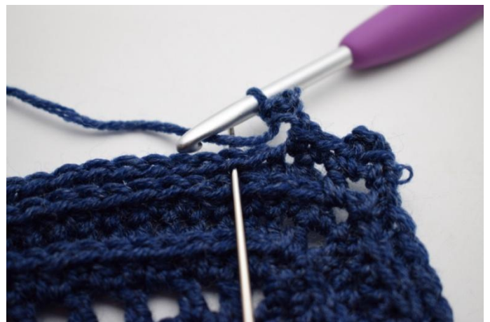
11. Skip 1 s and work 1 sc in the nexts".