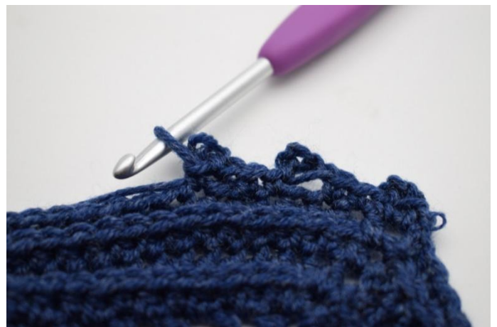
17. Like this.