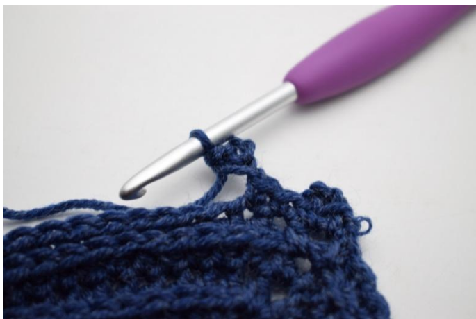
10. Like this.