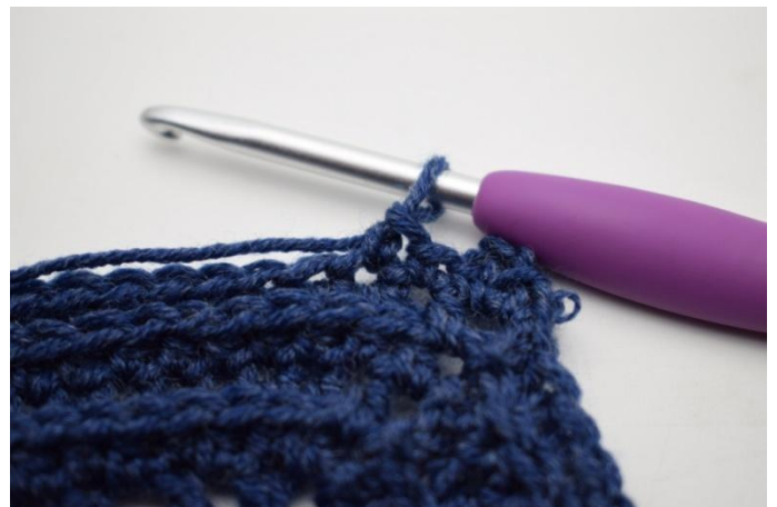
8. "Work 1 sc in the next s.