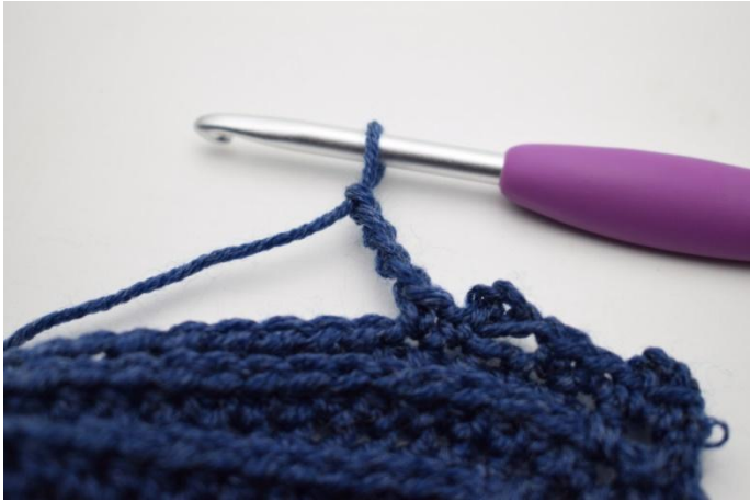
14. Ch 4.