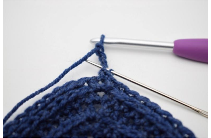
4. Work 1 ss in the first ch.