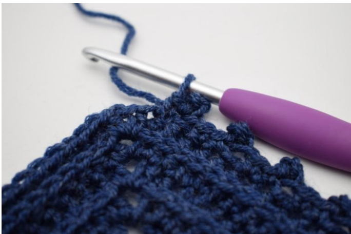
18. Repeat ”to” 59 times in total.