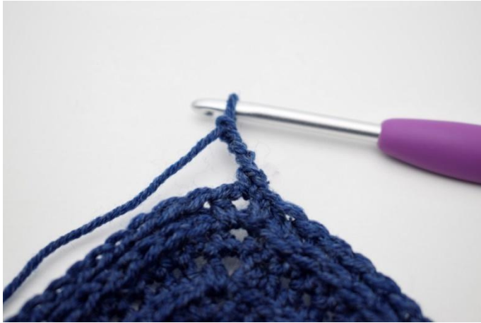
3. Ch 4.